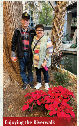
Enjoying the Riverwalk