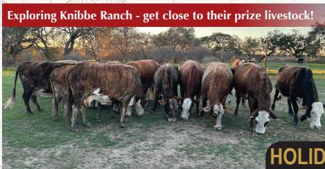
Exploring Knibbe Ranch - get close to their prize livestock!