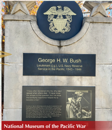
National Museum of the Pacific War