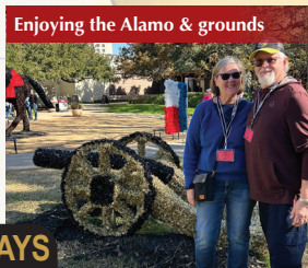
Enjoying the Alamo & grounds