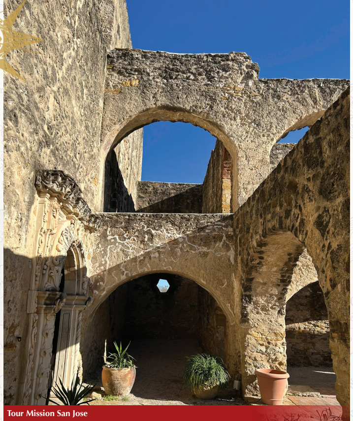
Tour Mission San Jose