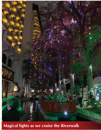
Magical lights as we cruise the Riverwalk