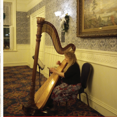
Harpist - St. James Hotel