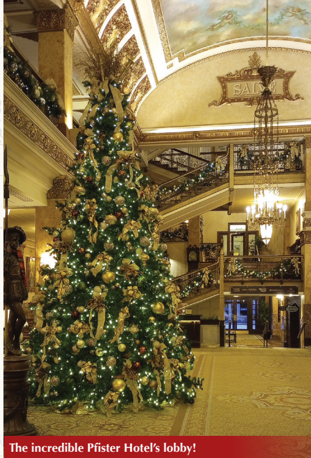
The incredible Pfister Hotel's lobby!

Start your day with another wonderful breakfast before we meet up with our outstanding tour guide. We begin with another culinary experience at Chef's Table. This high-end Christmas