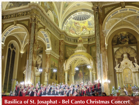
Basilica of St. Josaphat - Bel Canto Christmas Concert