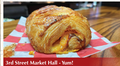
3rd Street Market Hall - Yum!