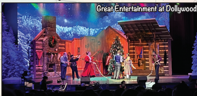
Great Entertainment at Dollywood