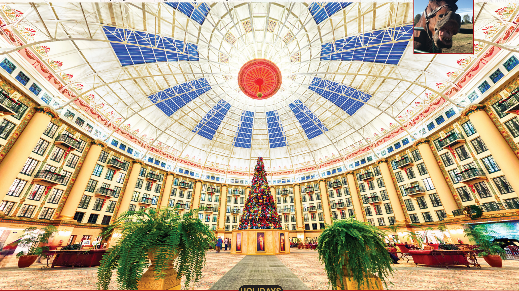
West Baden Springs Hotel's atrium in its Christmas finery!