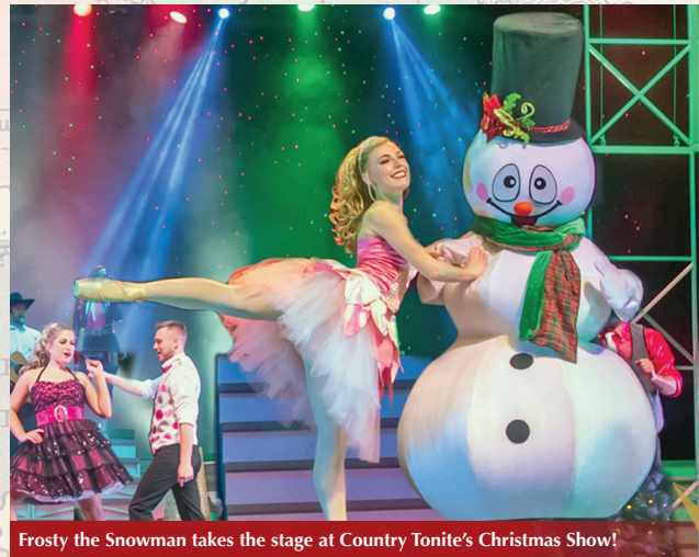
Frosty the Snowman takes the stage at Country Tonite's Christmas Show!