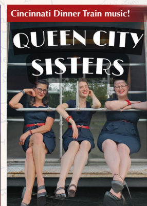
Cincinnati Dinner Train music!