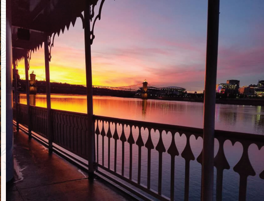
Take in the sunset during our river cruise!