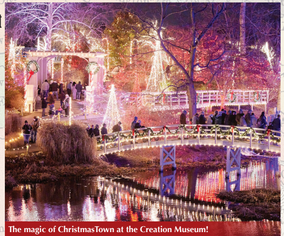
The magic of ChristmasTown at the Creation Museum!