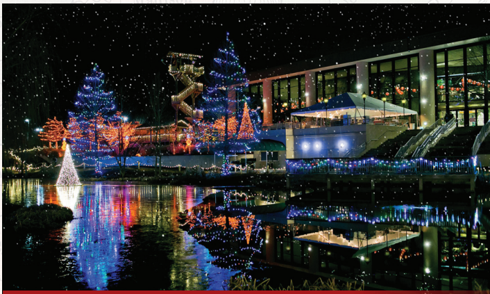
ChristmasTown at the Creation Museum - so beautiful & festive!