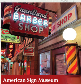
American Sign Museum