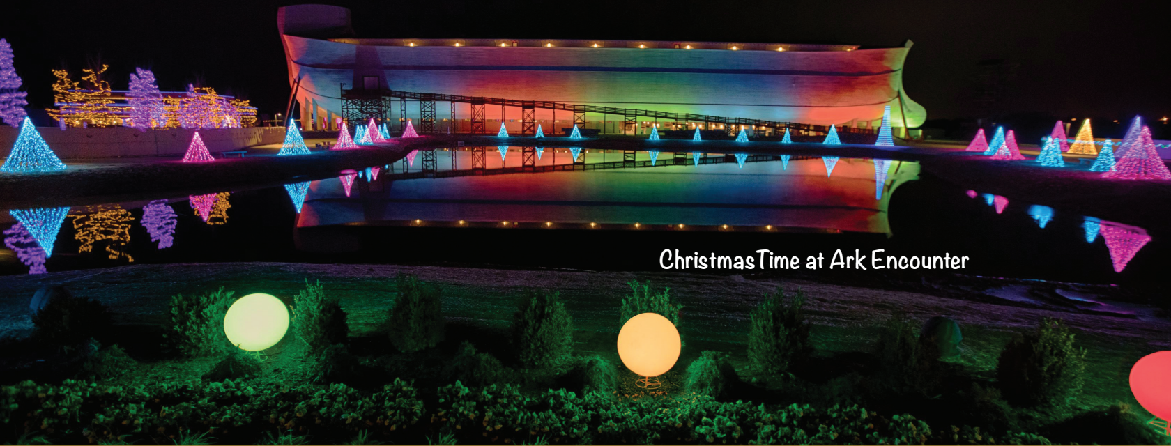
ChristmasTime at Ark Encounter