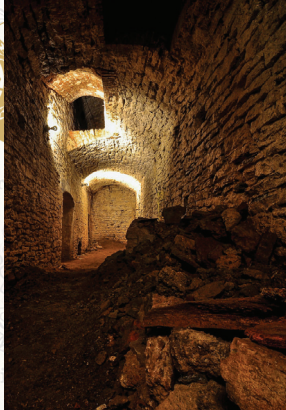
Queen City Underground Tour