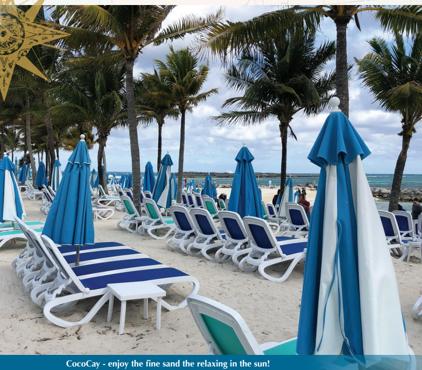
CocoCay - enjoy the fine sand the relaxing in the sun!