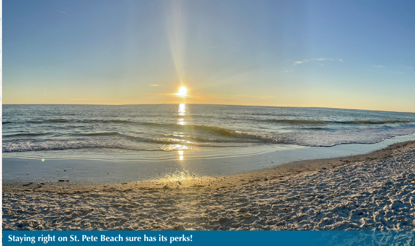
Staying right on St. Pete Beach sure has its perks!