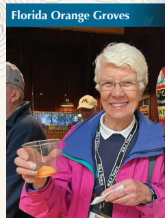
Florida Orange Groves