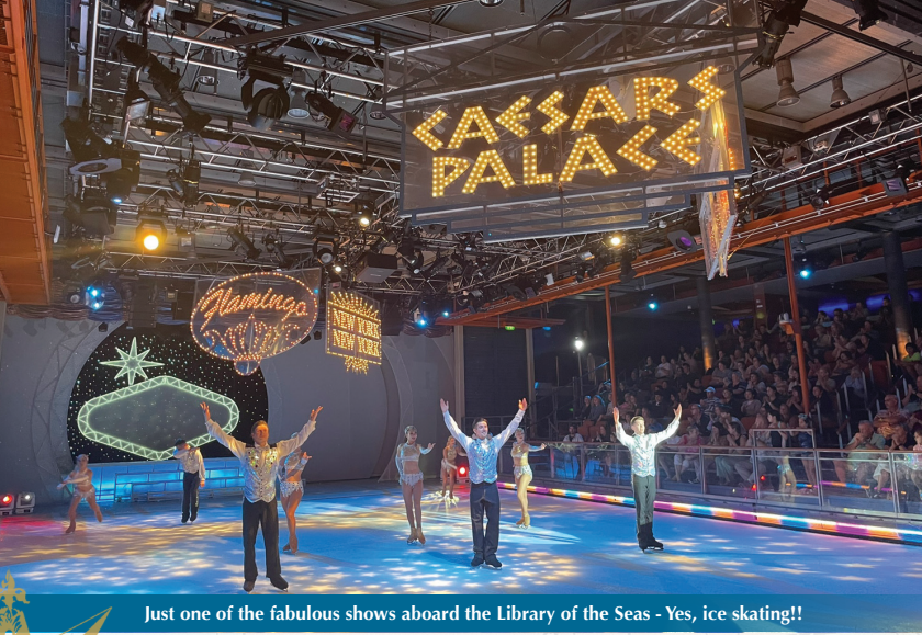
Just one of the fabulous shows aboard the Library of the Seas - Yes, ice skating!!