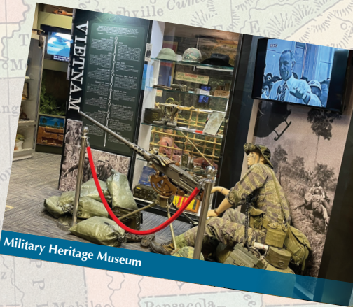
Military Heritage Museum