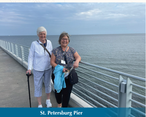
St. Petersburg Pier

Included Meals: Breakfast Sun, Sand and Sail