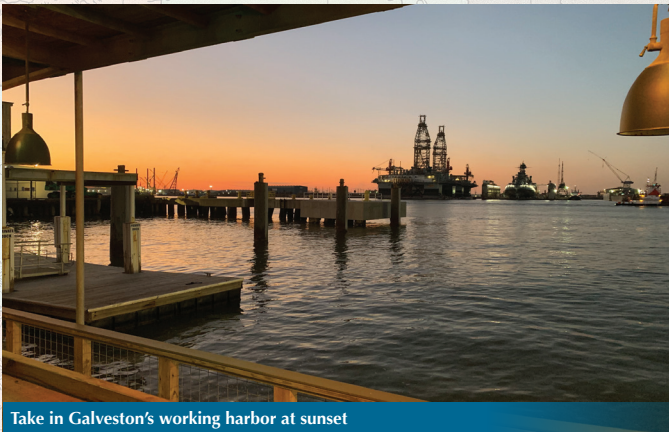
Take in Galveston's working harbor at sunset