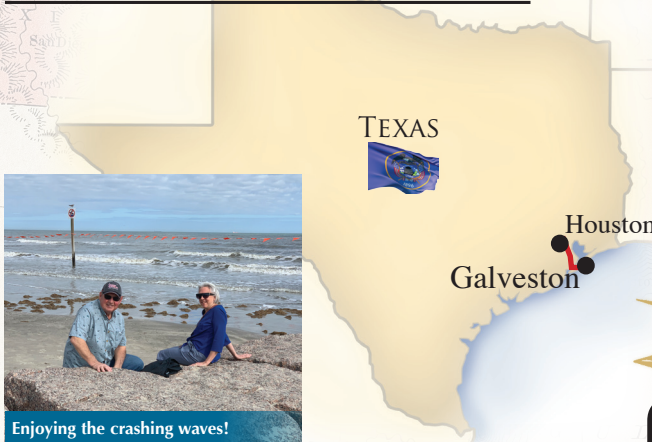
Enjoying the crashing waves!