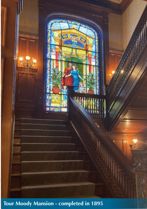
Tour Moody Mansion - completed in 1895

Touring the Galveston Naval Museum - USS Cavalla Submarine