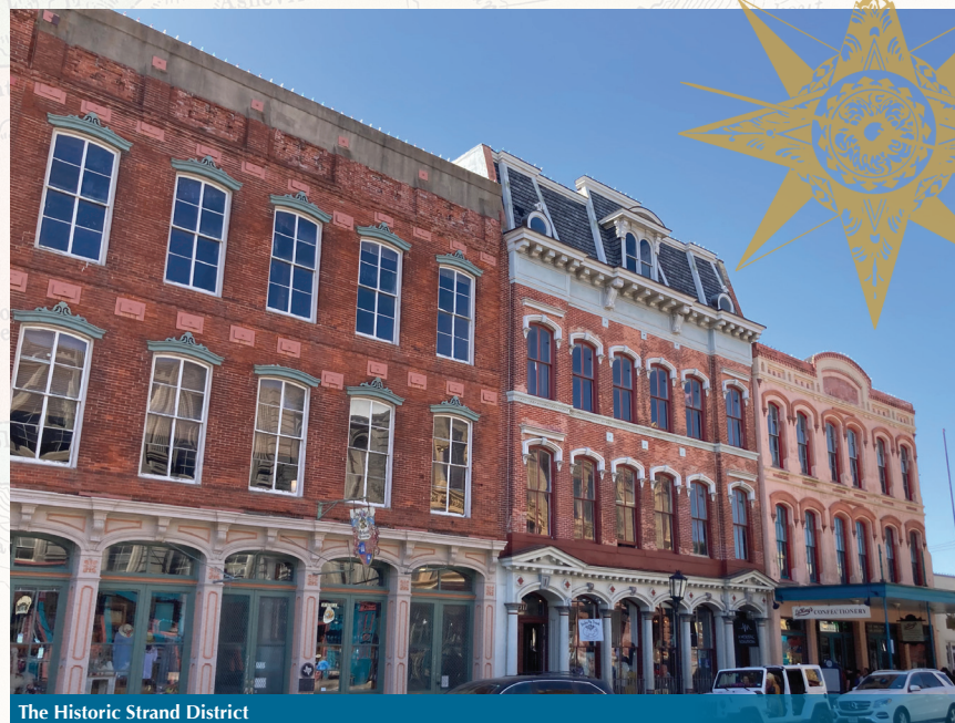
The Historic Strand District