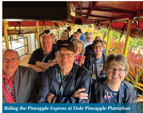
Riding the Pineapple Express at Dole Pineapple Plantation