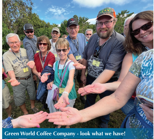
Green World Coffee Company - look what we have!

couple stops for candy or macadamia nuts before the highlight of our morning, Volcano National Park, a UNESCO World Heritage Site. We'll see Mauna Loa, the most massive mountain on earth, and Kilauea Crater, rising 4,090 ft. above a volcanic wonderland of steaming fire pits and fern forests. We'll enjoy an included lunch near the park. We'll continue on with our sightseeing ride along the eastern coast of the Big Island, with a stop or two along the way. Royal Kona Resort rests on a 12-acre volcanic outcropping, offering a dramatic oceanfront setting just steps from many restaurants, shops, and historic sites in Kailua-Kona. Take in