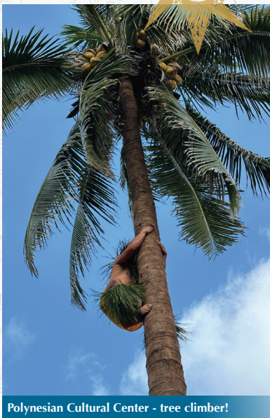
Polynesian Cultural Center - tree climber!

couple stops for candy or macadamia nuts before the highlight of our morning, Volcano National Park, a UNESCO World Heritage Site. We'll see Mauna Loa, the most massive mountain on earth, and Kilauea Crater, rising 4,090 ft. above a volcanic wonderland of steaming fire pits and fern forests. We'll enjoy an included lunch near the park. We'll continue on with our sightseeing ride along the eastern coast of the Big Island, with a stop or two along the way. Royal Kona Resort rests on a 12-acre volcanic outcropping, offering a dramatic oceanfront setting just steps from many restaurants, shops, and historic sites in Kailua-Kona. Take in