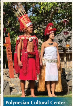
Polynesian Cultural Center