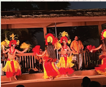
Maui Nui Luau's traditional ceremony