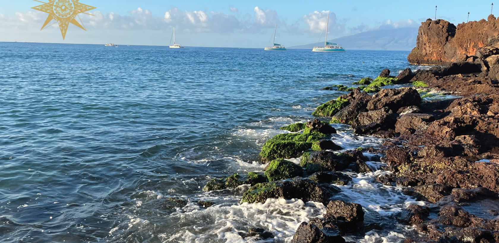
Breathtaking rugged & rocky coastline by Sheraton Maui Resort