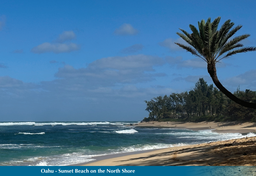
Oahu - Sunset Beach on the North Shore