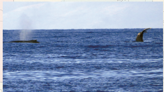
Exciting whale watching cruise

Enjoy the pool & stunning views at the Sheraton Maui Resort!