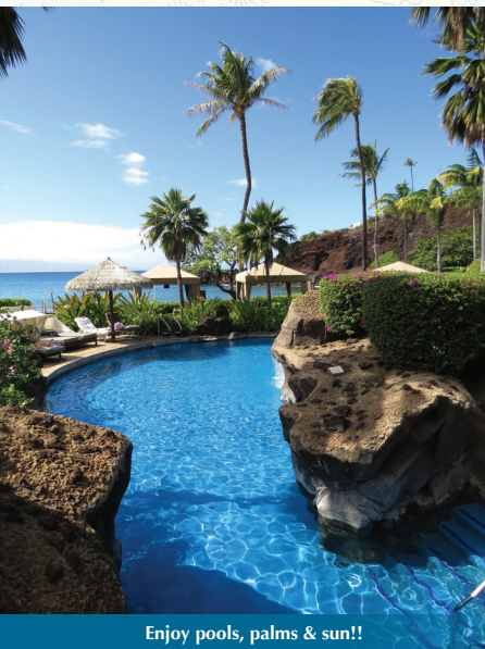
Enjoy pools, palms & sun!!