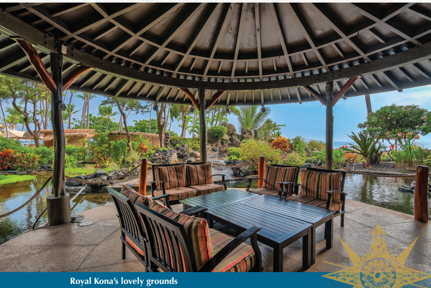
Royal Kona's lovely grounds