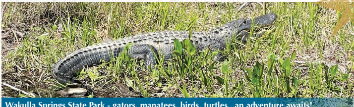
Wakulla Springs State Park - gators, manatees, birds, turtles...an adventure awaits!