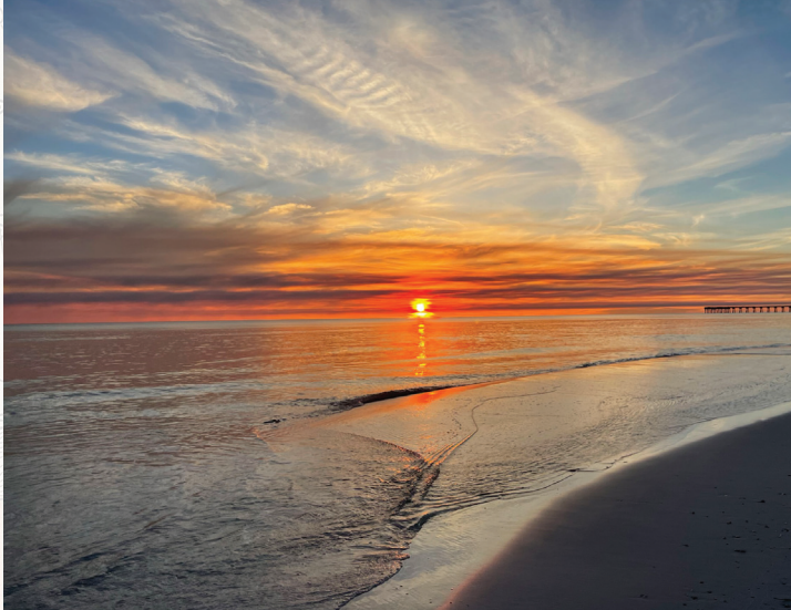
Panama City Beach produces breathtaking sunsets!