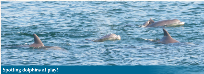
Spotting dolphins at play!

Included Meals: Breakfast Hotel: DoubleTree