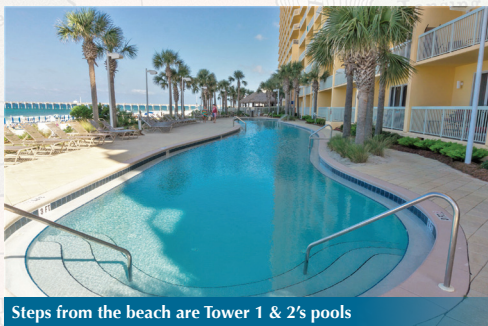
Steps from the beach are Tower 1 & 2's pools