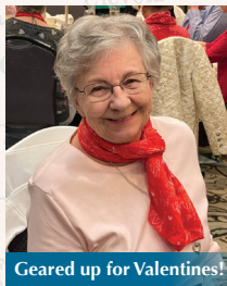
Geared up for Valentines!