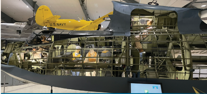
Pensacola Naval Aviation Museum