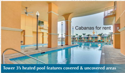
Tower 3's heated pool features covered & uncovered areas