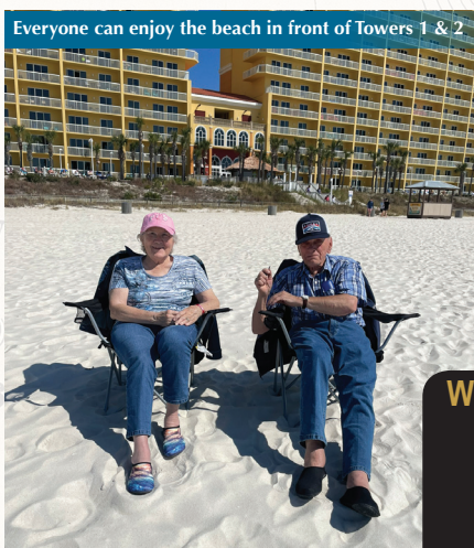
Everyone can enjoy the beach in front of Towers 1 & 2