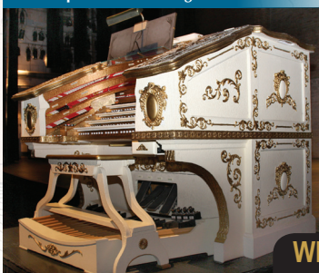
Rialto Square Theatre's organ

Included Meals: Breakfast, Dinner Hotel: Hotel Blackhawk