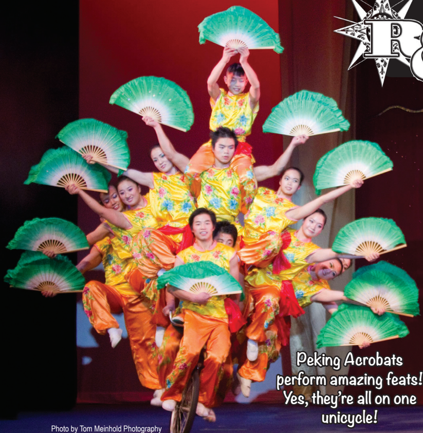
Peking Acrobats perform amazing feats! Yes, they're all on one unicycle!

Call after Sept. 5, 2024 for finalized brochure with shows & pricing!