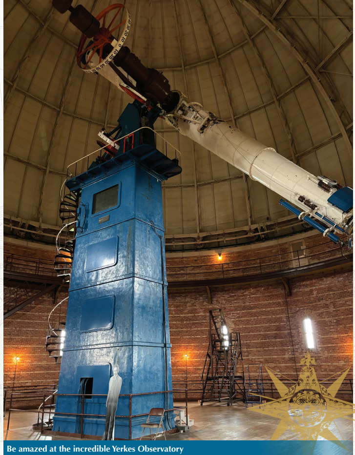
Be amazed at the incredible Yerkes Observatory