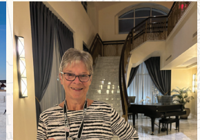
Hotel Blackhawk's grand stairs!