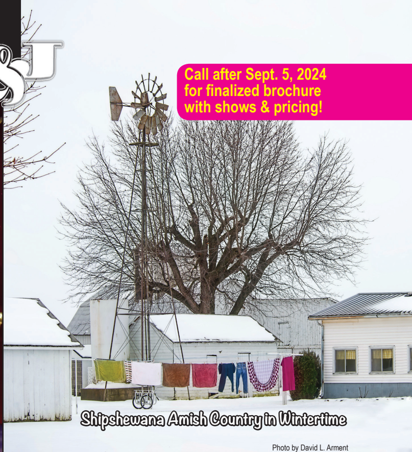
Shipshewana Amish Country in Wintertime