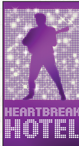
The Arch, Azaleas & Architecture