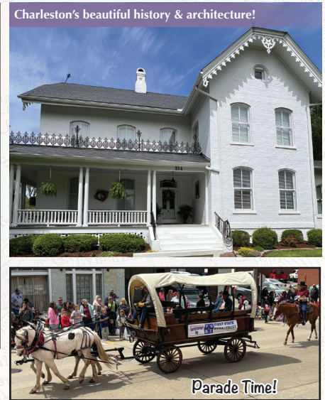
Charleston's beautiful history & architecture!