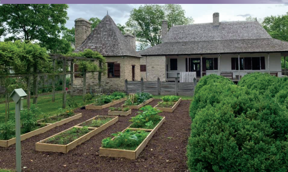
St. Genevieve - Centre for French Colonial Life