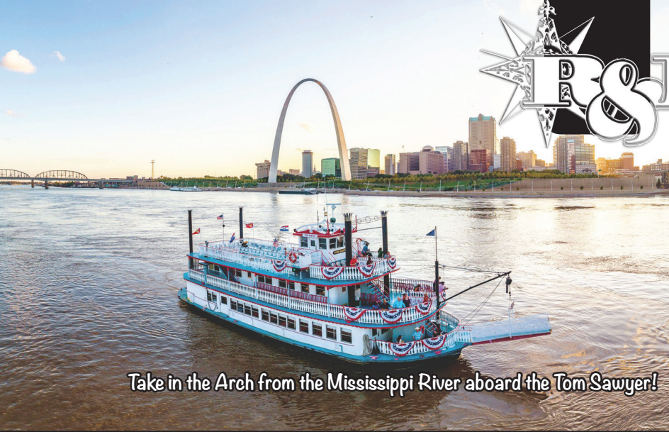
Take in the Arch from the Mississippi River aboard the Tom Sawyer!