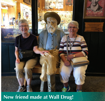
New friend made at Wall Drug!