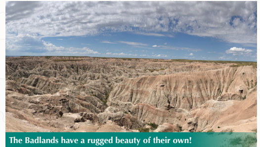
The Badlands have a rugged beauty of their own!