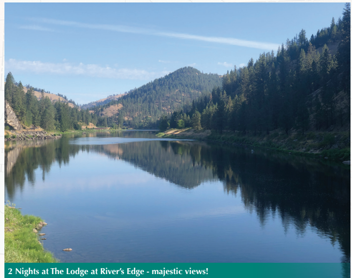
2 Nights at The Lodge at River's Edge - majestic views!