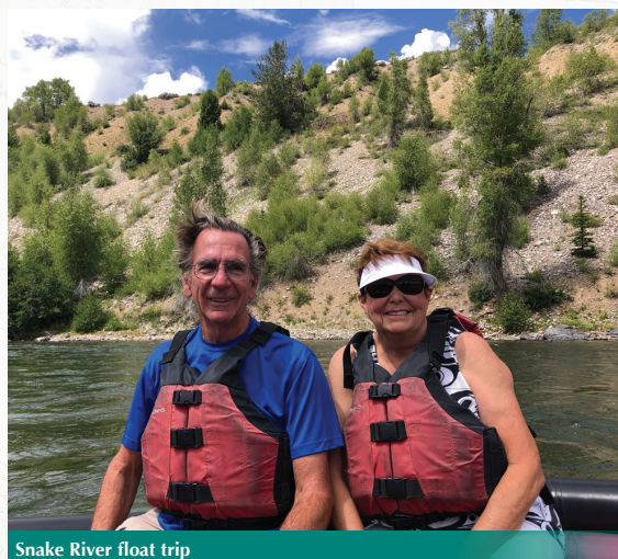
Snake River float trip