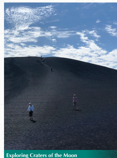
Exploring Craters of the Moon