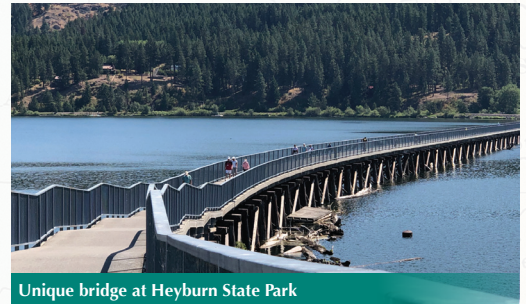
Unique bridge at Heyburn State Park

The serene yet powerful Snake River winds timelessly through the history of Jackson Hole beneath the geological grandeur of the majestic Grand Tetons. This river ecosystem is a bird watchers paradise where Golden & Bald Eagles prevail and herds of elk, mule deer, and moose abound. The rafts will gently carry us along one of the most beautiful stretches of river our country has to offer. Next is Moran Junction, known to be one of the most spectacular unheralded drives through the Bridger Teton National Forest and over Togwotee Pass. Watch for the ever-present possibility of wildlife gracing the wide-open fields of classic Wyoming ranch country. As we continue our drive, we will stop in Dubois for a comfort stop. Our hotel tonight is the Hampton Inn in Riverton, WY. Dinner tonight will be at the Rusty Truck in Riverton.