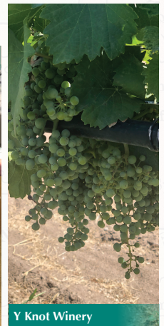
Y Knot Winery