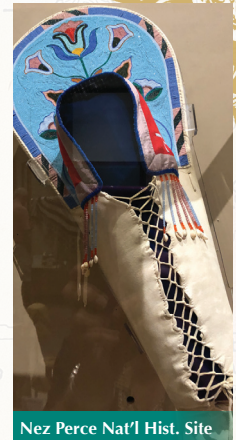
Nez Percé Nat'l Hist. Site