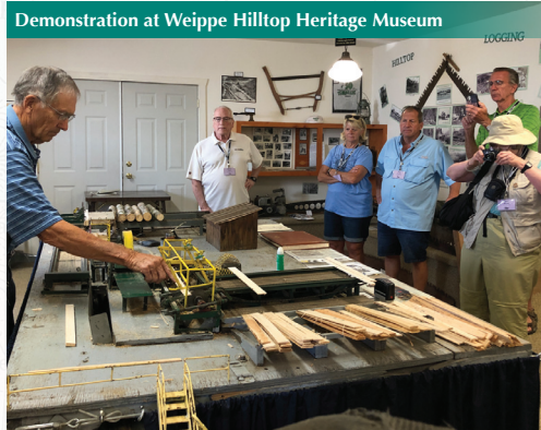
Demonstration at Weippe Hilltop Heritage Museum