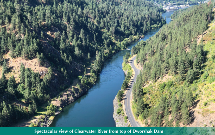
Spectacular view of Clearwater River from top of Dworshak Dam