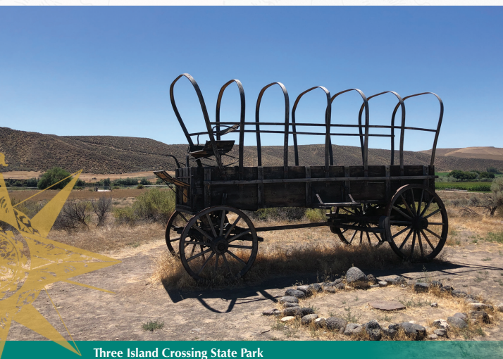
Three Island Crossing State Park