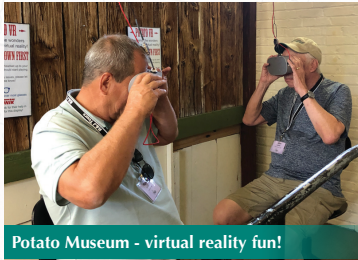
Potato Museum - virtual reality fun!