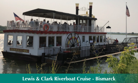
Lewis & Clark Riverboat Cruise - Bismarck