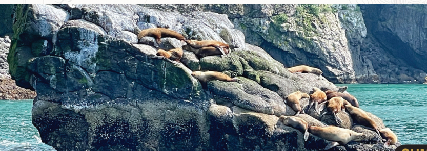
What a sighting during our Kenai Fjords Cruise!