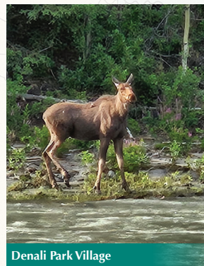
Denali Park Village