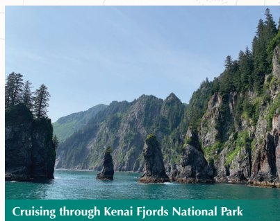
Cruising through Kenai Fjords National Park