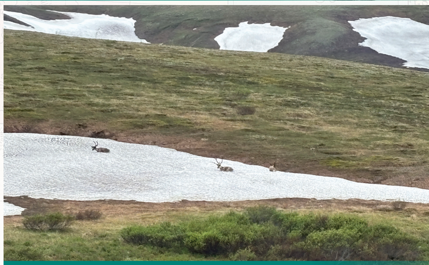
Denali National Park - Tundra Wilderness Tour spottings!

Included Meals: Breakfast, Snack, Dinner