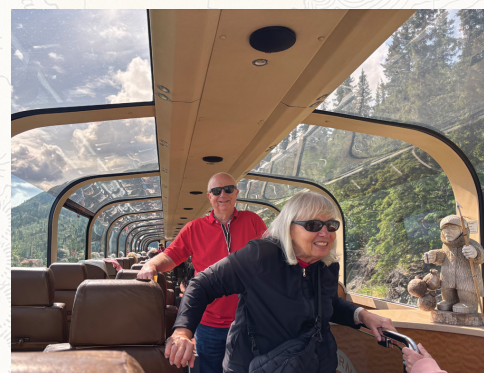
Full-length curved glass dome provides spectacular 360° views!