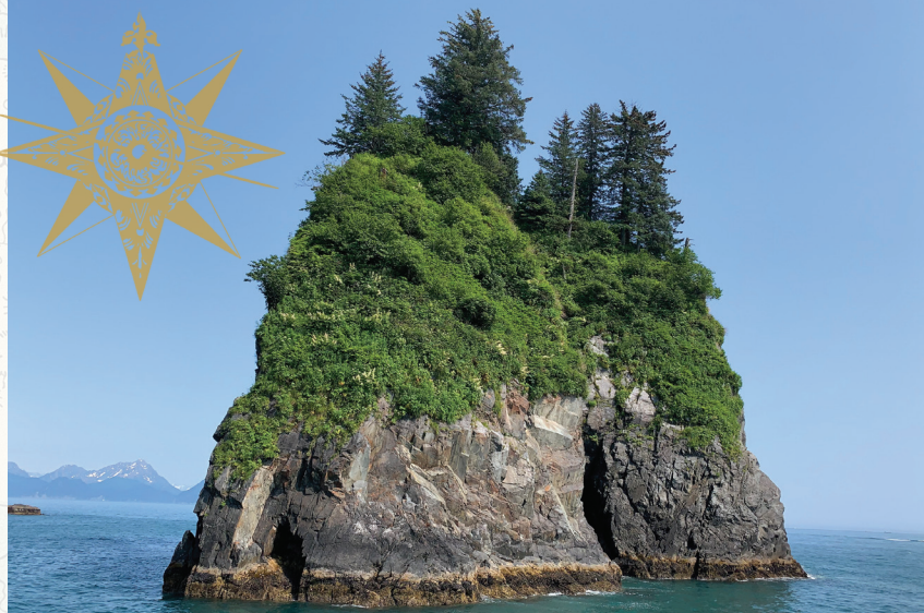
Spire Cove off Kenai Peninsula - Resurrection Bay