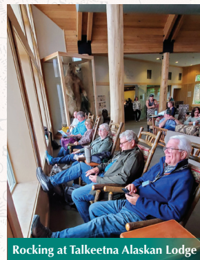
Rocking at Talkeetna Alaskan Lodge