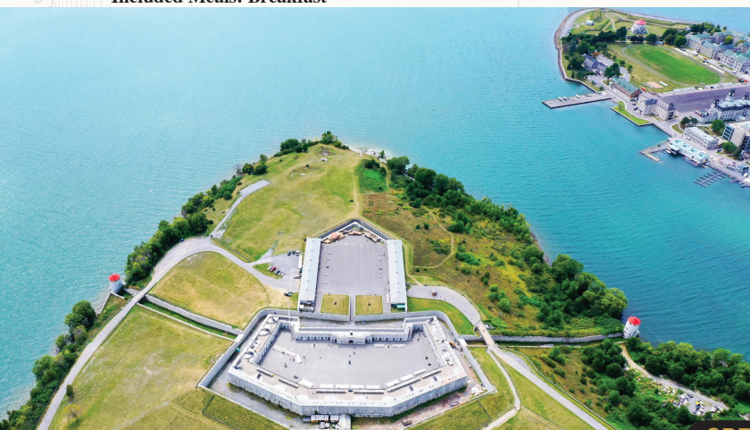
Visit Fort Henry National Historic Site - built between 1832-1837 on Point Henry