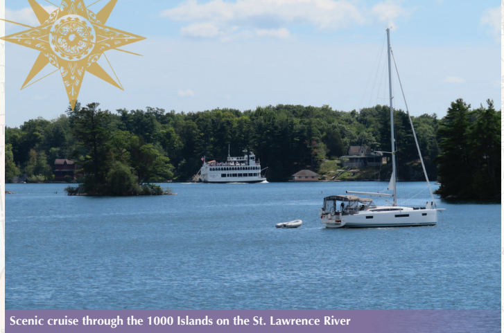
Scenic cruise through the 1000 Islands on the St. Lawrence River