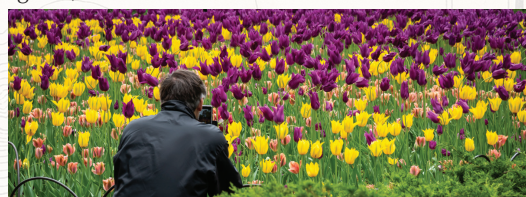
Have your cameras ready!