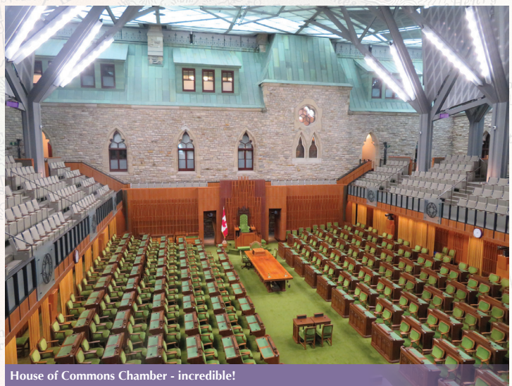
House of Commons Chamber - incredible!