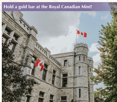
Hold a gold bar at the Royal Canadian Mint!