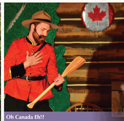
Oh Canada Eh?!