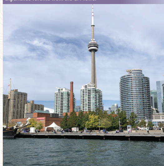
Experience Toronto from the CN Tower