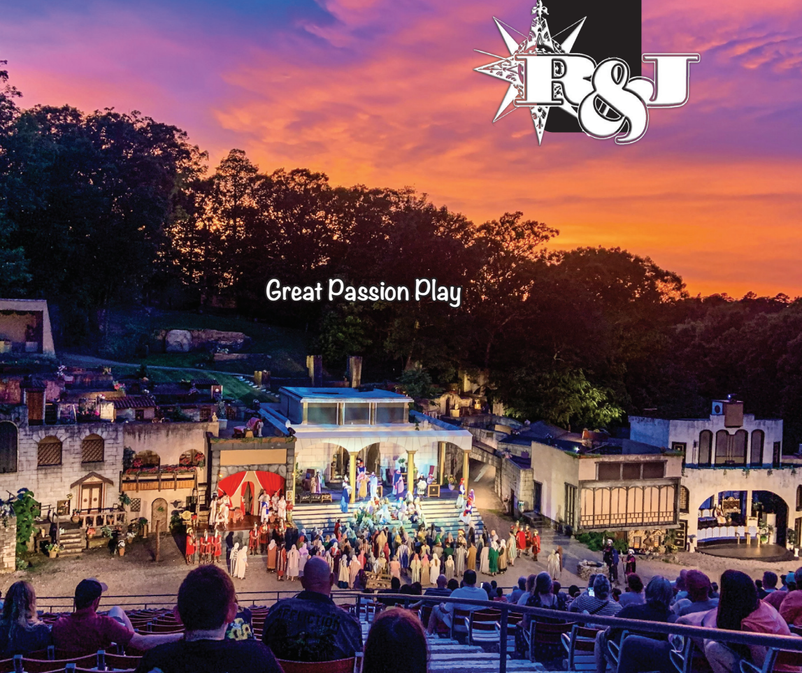
Great Passion Play