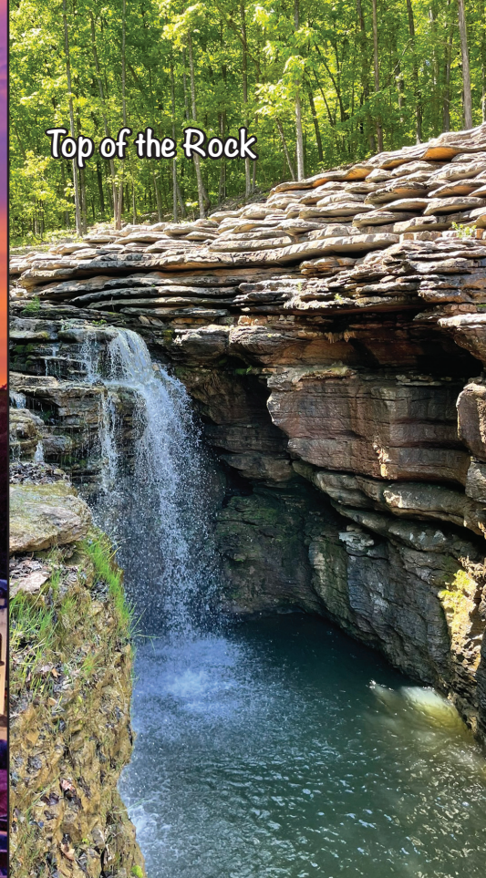
Top of the Rock