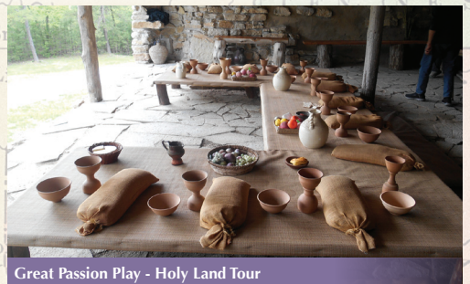
Great Passion Play - Holy Land Tour