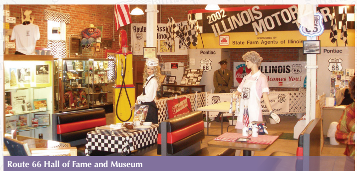
Route 66 Hall of Fame and Museum

beneath the Arch, offering immersive exhibits on westward expansion. Our tour continues through Forest Park, site of the 1904 World's Fair, before we enjoy lunch at Favazza's Restaurant, located in the heart of "The Hill," St. Louis's beloved Italian neighborhood. No Route 66 visit is complete without dessert at the legendary Ted Drewes Frozen Custard, a sweet stop that has delighted travelers for generations. In the afternoon, cruise down Historic Route 66 (Watson Road) to see some of the original mid-century motels still standing today. We'll wrap up our day in Maplewood, a vibrant district once a part of the original Route 66 path. Here, you'll have time to stroll the streets, browse locally owned boutiques, and discover one-of-a-kind treasures in this eclectic community. We'll return to the Drury for a relaxing evening and partake in the Kickback.