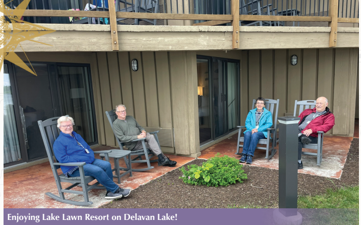
Enjoying Lake Lawn Resort on Delavan Lake!

This morning, a local guide joins us for a day full of history, charm, and Route 66 nostalgia. Enjoy a driving tour of downtown, the historic riverfront, and the neighborhoods of Soulard and Lafayette Square. Next, we visit the city's most famous landmark: the towering Gateway Arch. Choose between a thrilling tram ride to the top for sweeping views of the Mississippi River or a fascinating documentary film highlighting the Arch's remarkable construction. Afterward, take time to explore the interactive museum