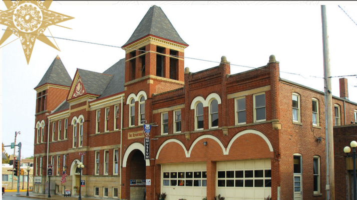
Nostalgic relics from The Mother Road can be found at the Route 66 Hall of Fame & Museum