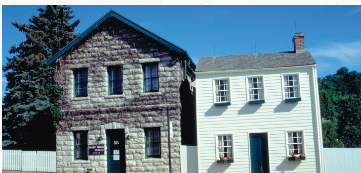
Explore Hannibal, MO - Mark Twain's hometown