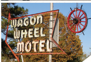
See iconic Route 66 landmarks

You may be surprised just how fascinating the Pearl Button Museum is!