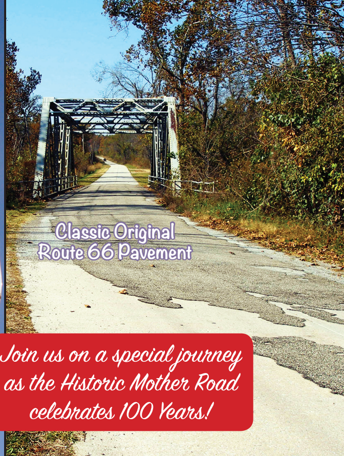
Classic Original Route 66 Pavement

Join us on a special journey as the Historic Mother Road celebrates 100 Years!