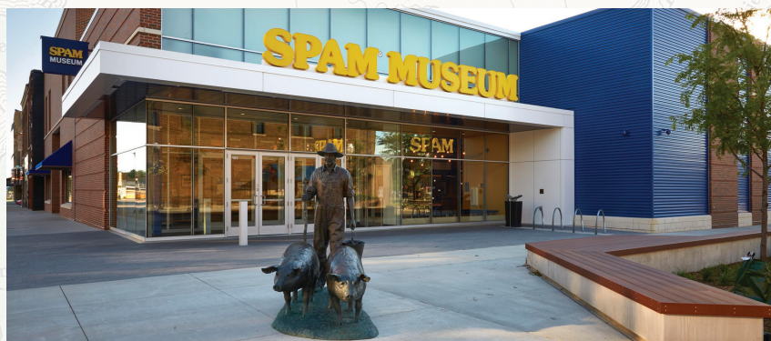
Visit the unique SPAM Museum!