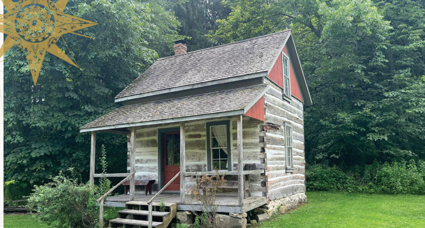
Noskedalen Heritage Center