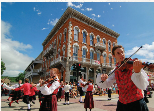
Be entertained by the parade at Nordic Fest