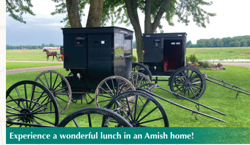
Experience a wonderful lunch in an Amish home!

Rise & shine for one last Blue Gate breakfast before we travel to Fort Atkinson, WI. After checking into our hotel, a fantastic dinner awaits at the Fireside Dinner Theatre, followed by their production of "Million Dollar Quartet!" On December 4, 1956, an extraordinary twist of fate brought Johnny Cash, Jerry