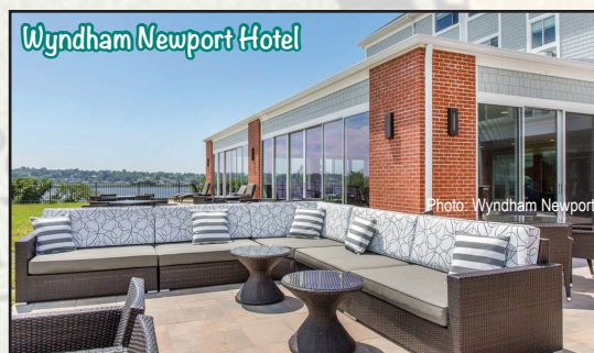
Wyndham Newport Hotel