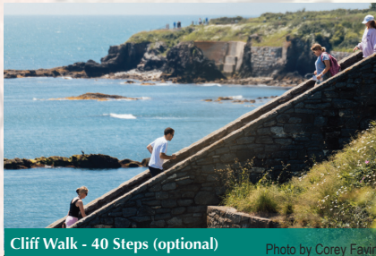
Cliff Walk - 40 Steps (optional)