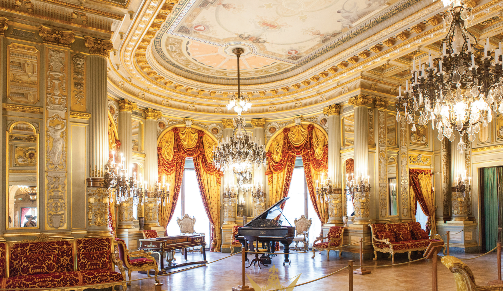
Breakers Mansion - this Music Room is a feast for the eyes!