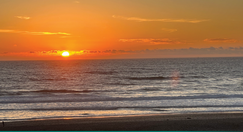
A lovely Newport sunset!