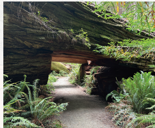
Ready to walk under this giant Redwood?!