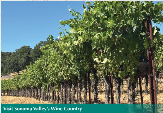
Visit Sonoma Valley's Wine Country