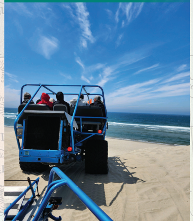
Sand dune ride is beautiful!