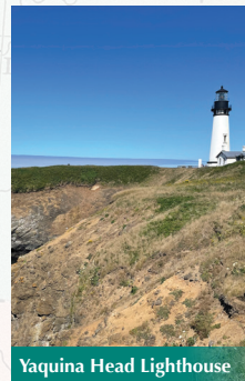
Yaquina Head Lighthouse