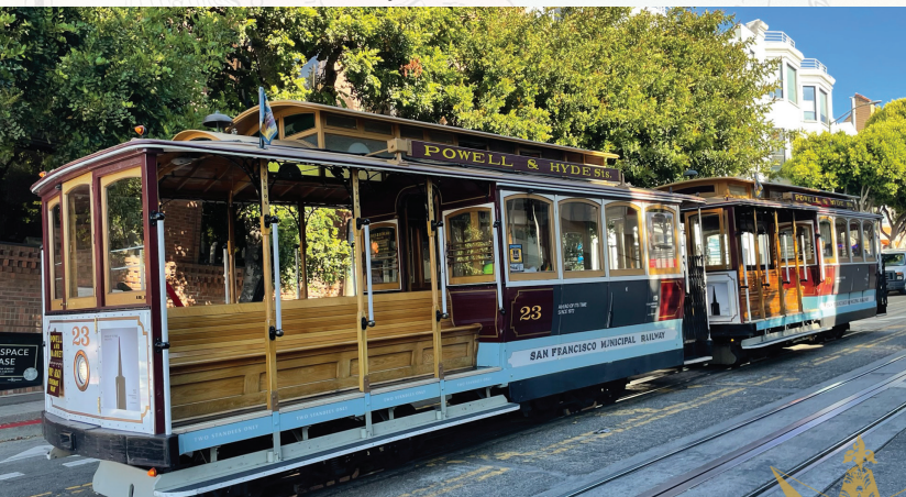
San Francisco is known for their street trolleys