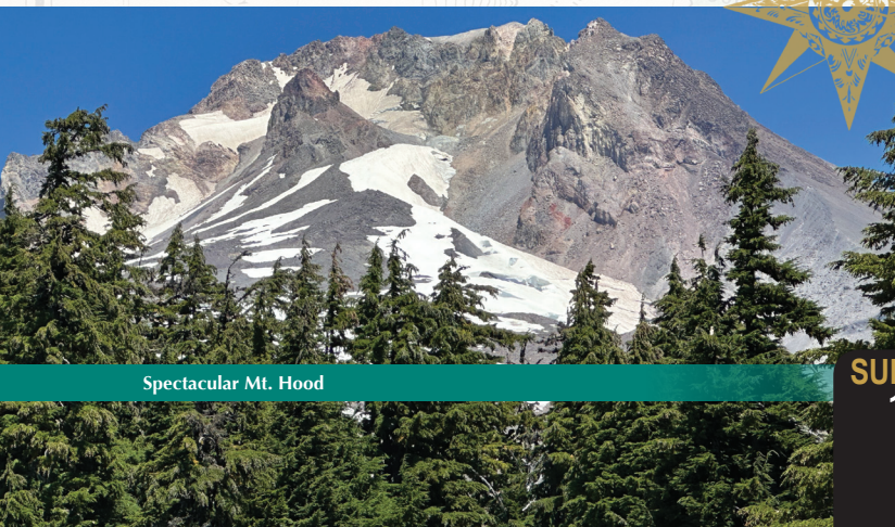
Spectacular Mt. Hood