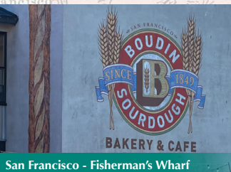
San Francisco - Fisherman's Wharf