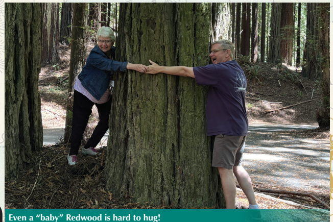
Even a "baby" Redwood is hard to hug!