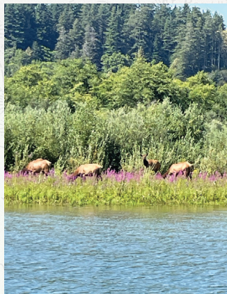
Elk along Rogue River