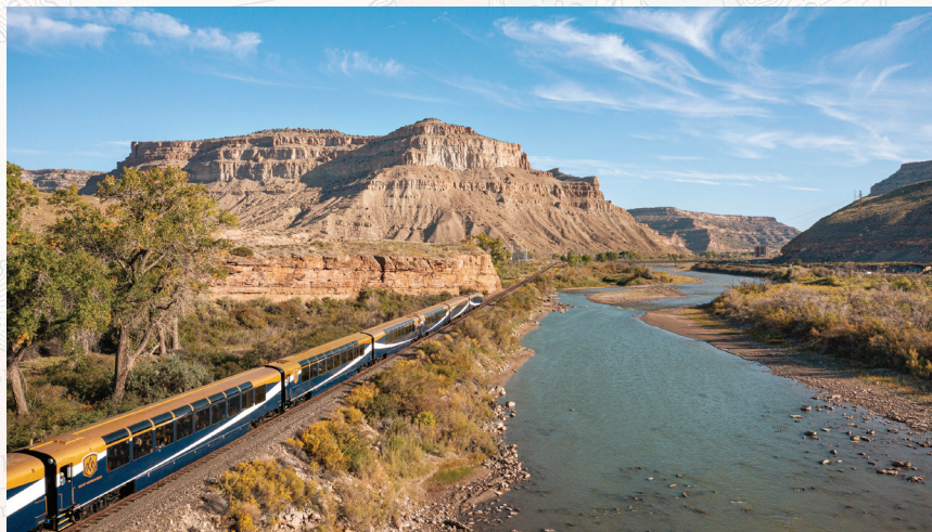
Railing through Debeque Canyon