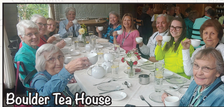
Boulder Tea House