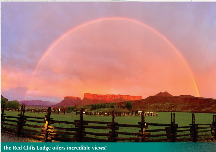
The Red Cliffs Lodge offers incredible views!