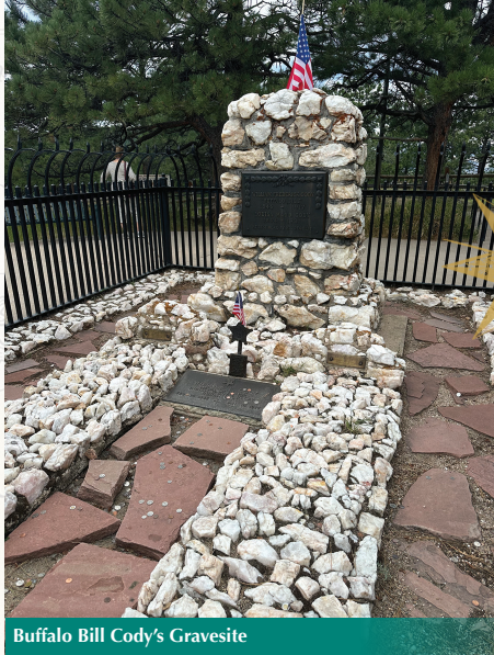
Buffalo Bill Cody's Gravesite