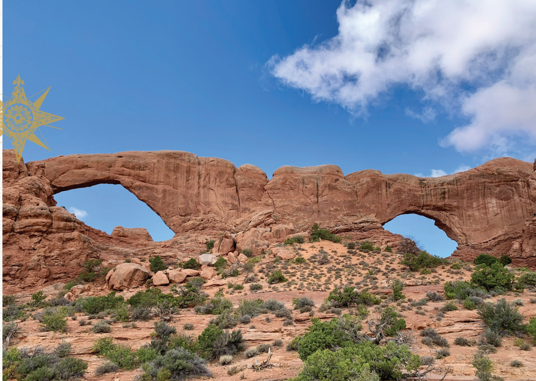
Arches National Park is truly a sight to behold - North & South Windows!

Rise this morning and listen to the flowing water just outside your door before you have breakfast at the lodge. Take in the beauty of the sunrise as you enjoy your breakfast this morning. Today, we'll travel along the river on our short drive to the "Islands in the Sky" section of Canyonlands National Park. Here we will ex-