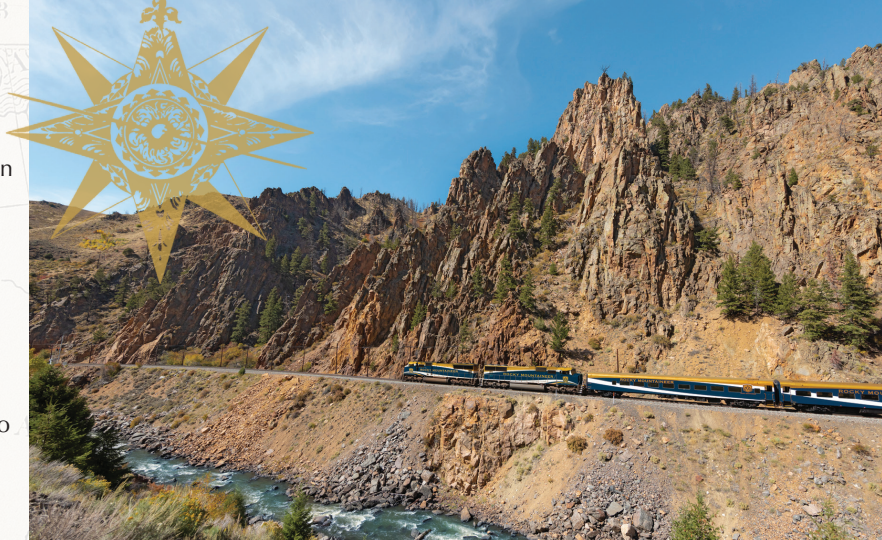
Canyon Spirit guiding us through Byers Canyon