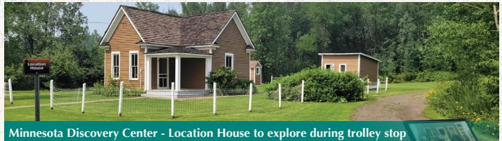
Minnesota Discovery Center - Location House to explore during trolley stop

and to watch a second locomotive being coupled to the train to pull us back to the depot. We'll return home having experienced the Wildlife & Wilderness of Minnesota's Iron Range!