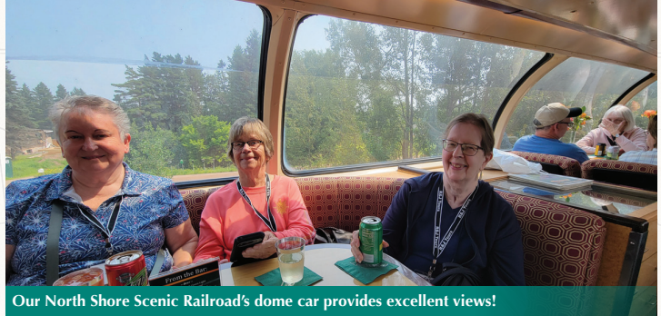
Our North Shore Scenic Railroad's dome car provides excellent views!