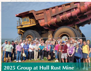
2025 Group at Hull Rust Mine

Have one last breakfast before we check out and make our way east to majestic Lake Superior. A wonderful Italian meal is served at Valentini's in Duluth. Next we head to the Lake Superior & Mississippi Railroad Co. All aboard the Duluth River Train for a 6-mile rail journey along the scenic St. Louis River. You may wish to visit the open-air car to capture the sights with your camera