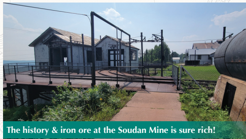
The history & iron ore at the Soudan Mine is sure rich!