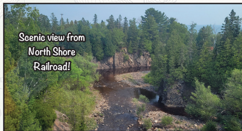
Scenic view from North Shore Railroad!