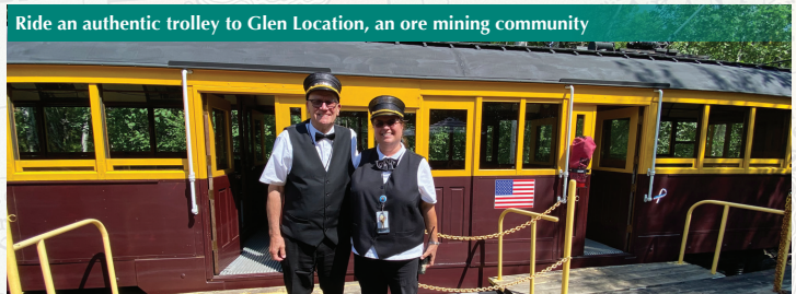
Ride an authentic trolley to Glen Location, an ore mining community