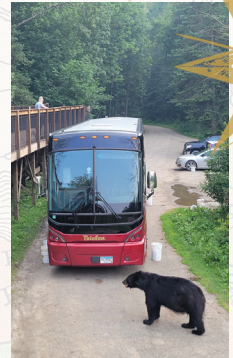
Someone likes our coach!