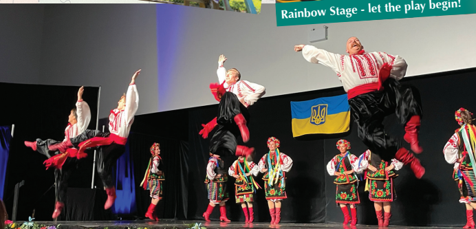
Two evenings to experience the culture of Folklorama!