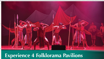
Experience 4 Folklorama Pavilions

This morning we'll take a self-guided tour of the Canadian Museum for Human Rights, which will take us on a journey of education and inspiration unlike anything we've experienced before. After an included lunch at the museum, we head to The Forks, the city's most popular gathering place, located at the junction of the Red and Assiniboine Rivers. Here we'll board a scenic river cruise, where a local guide will share stories of Winnipeg's history and point out key landmarks along the way. Highlights include the Manitoba Legislative Building, the Canadian Museum for Human Rights, a glimpse of the St. Boniface Cathedral, and several of the city's unique bridges and architectural treasures. Afterwards, time is given to explore The Forks at your own pace. This historic meeting place has welcomed people for over 6,000 years - from Indigenous trading gatherings and fur traders to European settlers and new immigrants. Today, it offers riverfront walking paths, open-air spaces, boutique shops, and plenty of food stalls