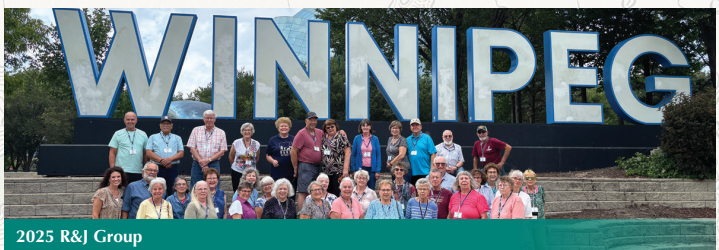
2025 R&J Group

and cafés. Relax by the river, stroll the marketplace, or treat yourself to a local snack before returning to our hotel. This evening we'll enjoy another exciting night at Folklorama, featuring two additional cultural pavilions. At the first pavilion, savor a full cultural dinner, followed by lively entertainment. At the second, we'll be treated to a cultural dessert along with another vibrant performance. (The specific pavilions will be announced closer to the tour.)