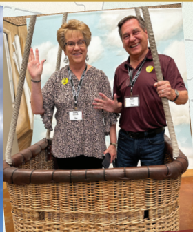
Albuquerque Balloon Museum