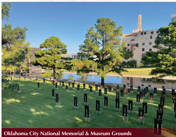
Oklahoma City National Memorial & Museum Grounds

ing on April 19, 1995. After visiting the memorial we will visit The Memorial Museum, which is an interactive learning experience that takes you on a chronological self-guided tour through the story of April 19, 1995, and the days, weeks and years that followed the bombing of Oklahoma City's Alfred P. Murrah Federal Building. The story tracks the remarkable journey of loss, resilience, justice and hope. A delicious lunch is included in Oklahoma City before we depart for a visit to the Groom Cross, a 19-story cross located next to Interstate 40. This 190-foot-tall, free-standing cross can be seen from 20 miles away. Surrounding the base of the cross are life-sized statues of the 14 Stations of the Cross. Our journey will then continue on to Amarillo, TX where we will spend the night. Enjoy the Drury's "Kickback" Reception.