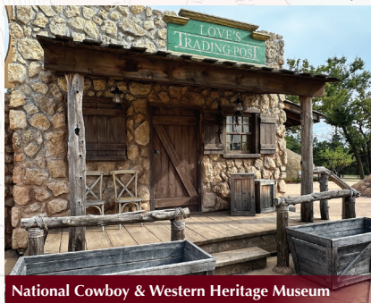
National Cowboy & Western Heritage Museum

After breakfast at the hotel, we will depart for the Oklahoma City National Memorial, a memorial that honors the victims, survivors, rescuers, and all who were affected by the Oklahoma City bomb-