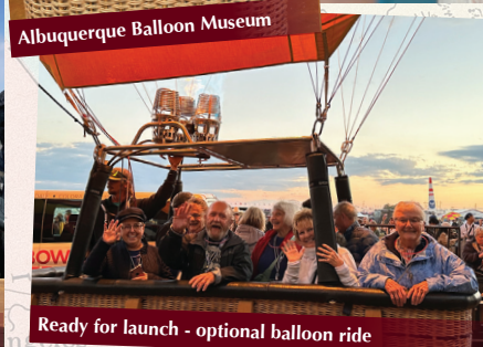
Ready for launch - optional balloon ride