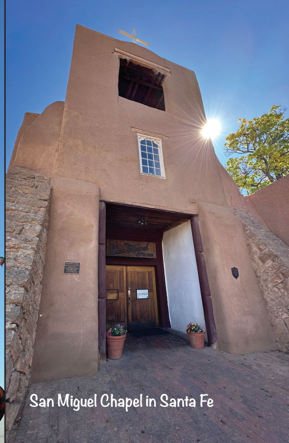
San Miguel Chapel in Santa Fe