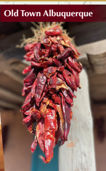
Old Town Albuquerque