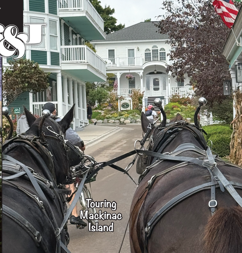
Touring Mackinac Island