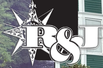
Upper Tahquamenon Falls