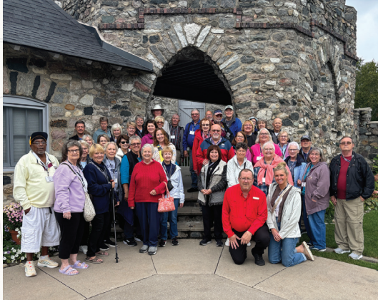
History comes to life as we tour Castle Farms - 2025 R&J group & garden bench