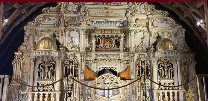
Music House Museum - 1922 Mortier Dance "Amaryllis" Organ from Belgium