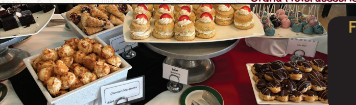
Grand Hotel desserts