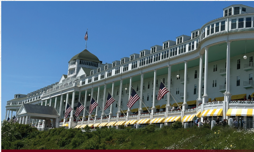
Magnificent Grand Hotel - a delightful lunch & an enormous porch await!

Breakfast will be served at the hotel before we motor along the beautiful shores of the west coast of Michigan. We'll visit the Music House Museum where we'll walk through the history, artistry, and engineering of automated music as we view their unique collection of instruments. Then we'll stop in Traverse City for lunch and shopping on your own. Next we continue on to Ludington, a charming port town, where we'll check into our hotel. We invite you, our special guests, to dinner at a delightful restaurant. Included Meals: Breakfast, Dinner Hotel: Holiday Inn Express