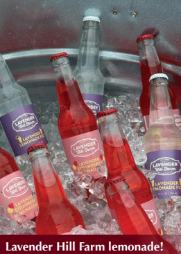
Lavender Hill Farm lemonade!

Included Meals: Breakfast, Lunch, Dinner