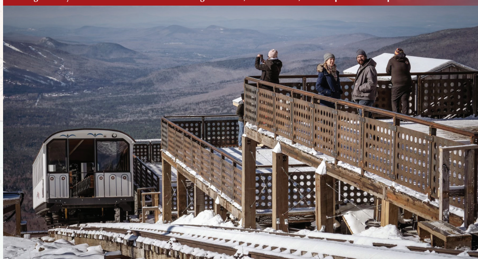
The Cog Railway takes us to Waumbek Station for great views, refreshments, & a fire pit to warm up!