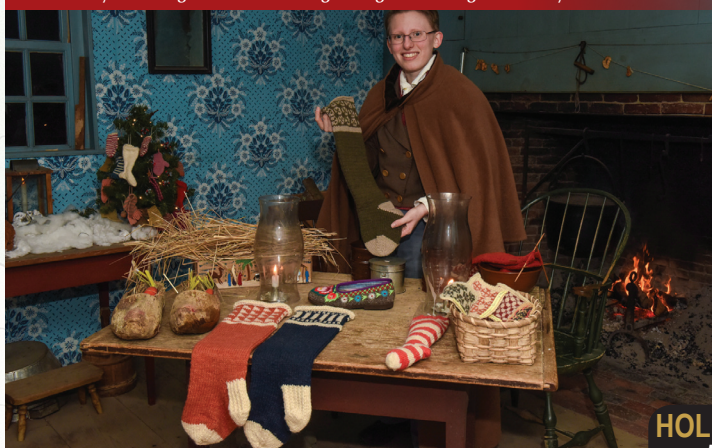
Christmas by Candlelight at Old Sturbridge Village - New England history comes to life!