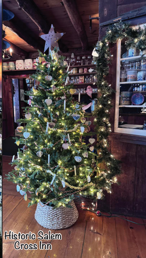
Historic Salem Cross Inn