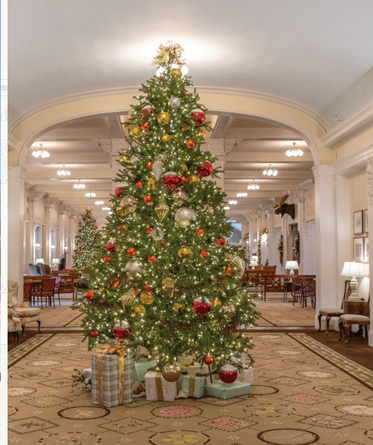
Christmas at Omni Mount Washington Resort

place to purchase Christmas presents! Before we depart, we'll each choose from their variety of decorated Christmas wreaths - a lovely gift that will be shipped right to our home! Next we'll enjoy lunch and beer tasting at the Woodstock Inn Brewery. This family-owned brewery offers us a unique dining experience where craft beer meets exceptional pub fare. Boasting a welcoming atmosphere of a New England Inn, they serve quintessential New England food. We'll be treated to a small glass of the brewery's exceptional, local brew of the day. Seeing as we're in Bethlehem, we'll make a special stop at the Bethlehem Post Office. Plan ahead and bring your ready-to-mail Christmas cards, each complete with a stamp, and they'll be postmarked to your friends & family from Bethlehem! Returning to our resort, dinner is on your own. If you're not ready to call it a day, maybe you wish to soak in the hot tub and/or the indoor or outdoor pools (both heated!) Or perhaps you wish to book (at your own expense) a nostalgic, horse-drawn sleigh ride as you cozy up under warm blankets and glide through the tranquil stillness of Bretton Woods' wonderland of white!