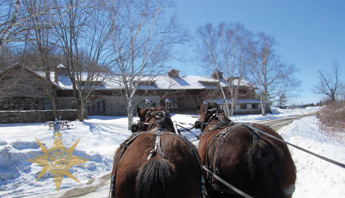
Explore The Rocks Estate by horse-drawn wagon ride - it's quite the place!