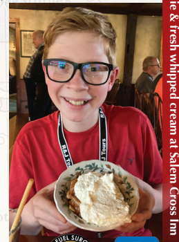
Apple pie & fresh whipped cream at Salem Cross Inn