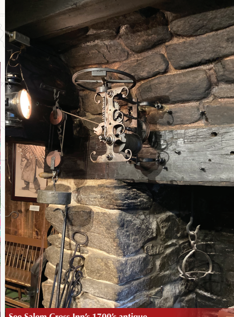
See Salem Cross Inn's 1700's antique roasting jack - a Fireplace Feast awaits!