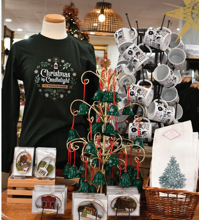
Christmas treasures in Old Sturbridge Village