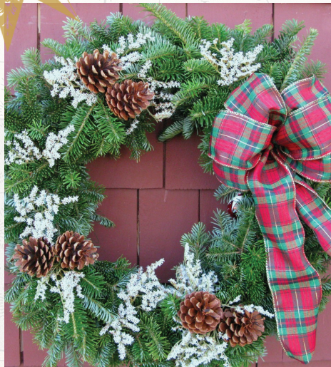
Pick out a fresh Christmas wreath that'll be shipped home!