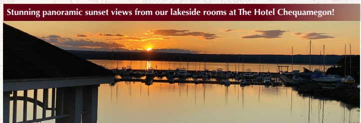
Stunning panoramic sunset views from our lakeside rooms at The Hotel Chequamegon!