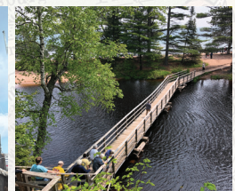
Exploring Madeline Island