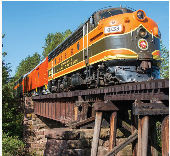
Explore the beautiful northwoods on the Wisconsin Great Northern Railroad