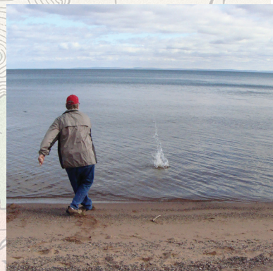
Big Bay State Park