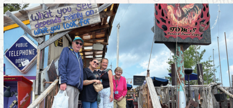
What treasures will these travelers find on Madeline Island?