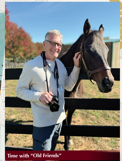
Time with "Old Friends"

"We were asked to name one or two highlights - not possible! I easily came up with six to seven! This is a very complete tour of the area... Our guide and driver were very good."