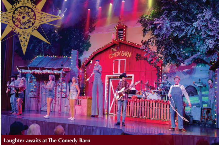
Laughter awaits at The Comedy Barn