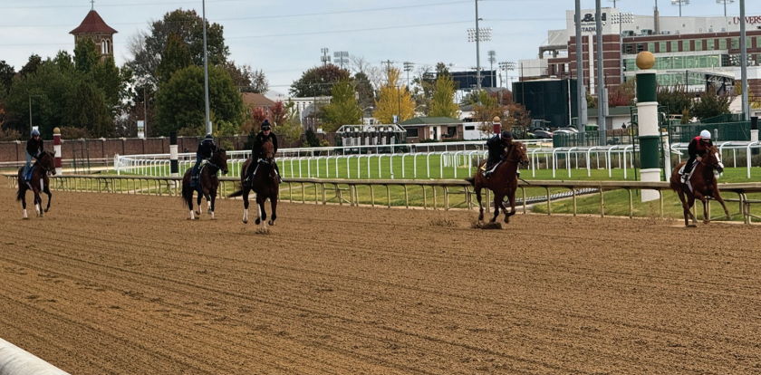
Churchill Downs - go, go, GO!