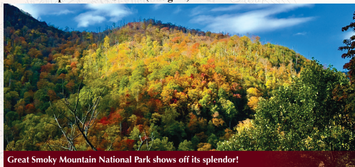
Great Smoky Mountain National Park shows off its splendor!