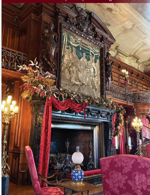
The Biltmore Estate's library is truly astonishing!