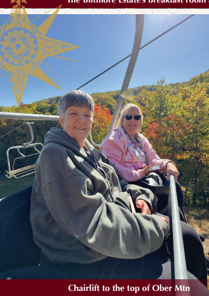
Chairlift to the top of Ober Mtn