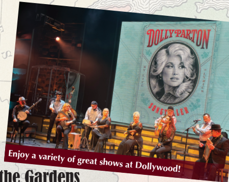
Enjoy a variety of great shows at Dollywood!