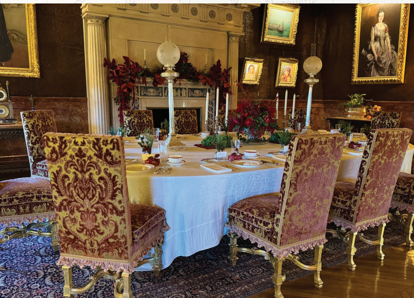
The Biltmore Estate's breakfast room already decorated for Christmas!