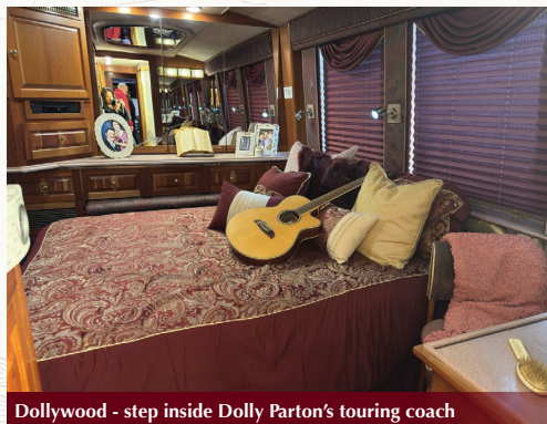
Dollywood - step inside Dolly Parton's touring coach