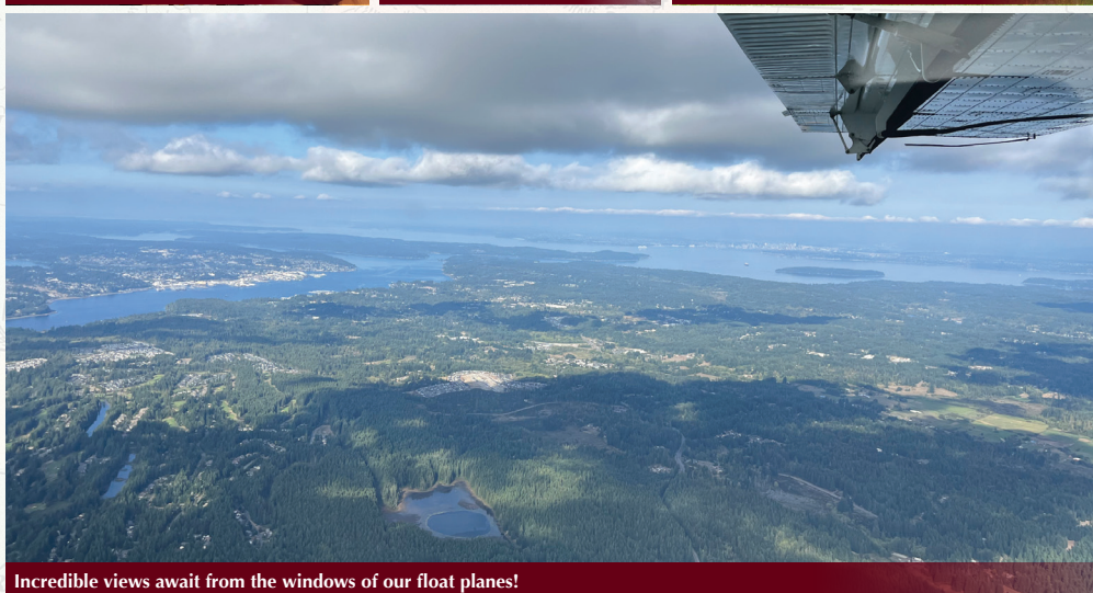
Incredible views await from the windows of our float planes!