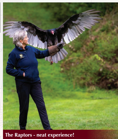
The Raptors - neat experience!