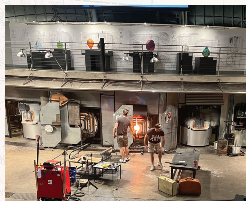
Glowblowing at the Museum of Glass