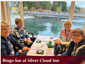
Bingo fun at Silver Cloud Inn