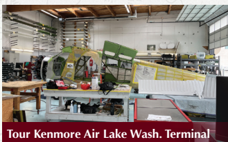
Tour Kenmore Air Lake Wash. Terminal