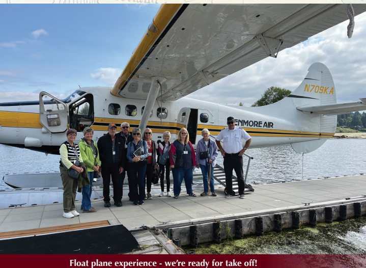
Float plane experience - we're ready for take off!