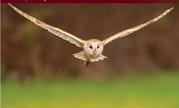
Be awed by The Raptors!