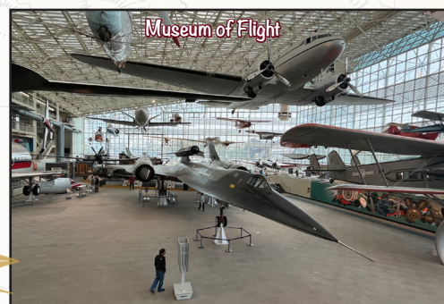
Museum of Flight