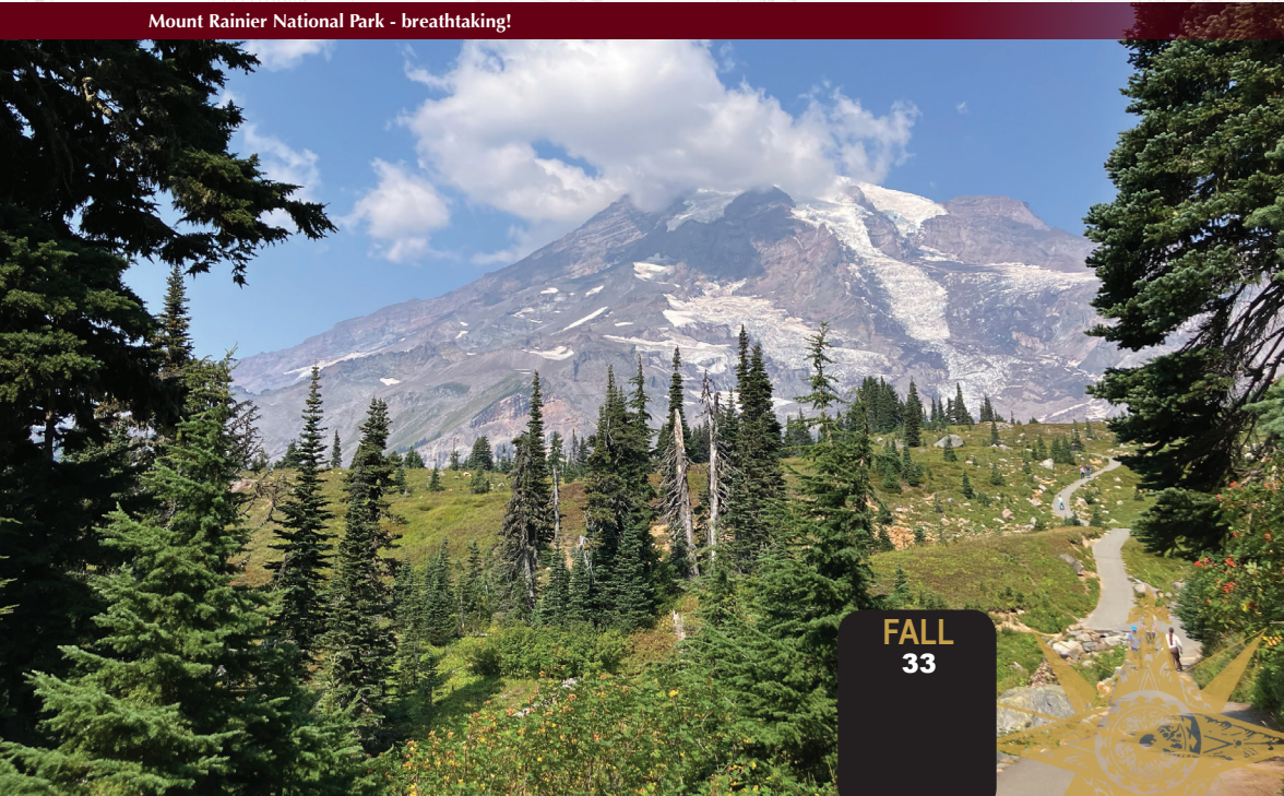
Mount Rainier National Park - breathtaking!