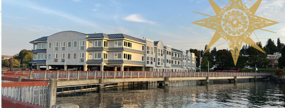
Stay 3 nights on the waterfront in Tacoma - what a perfect setting!!