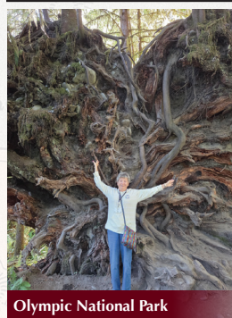
Olympic National Park