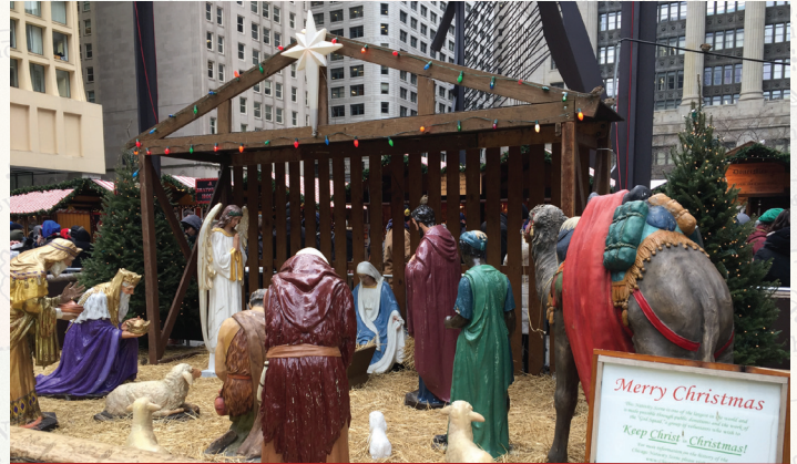
See the large Chicago Nativity Scene at Daley Plaza