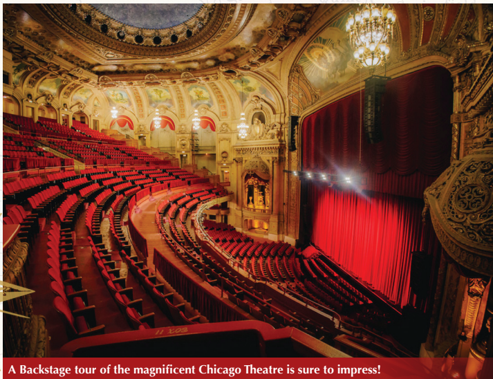
A Backstage tour of the magnificent Chicago Theatre is sure to impress!