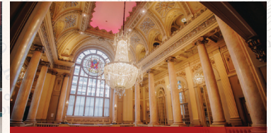
Chicago Theatre's grand lobby