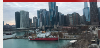
Cruise out and see Chicago's skyline