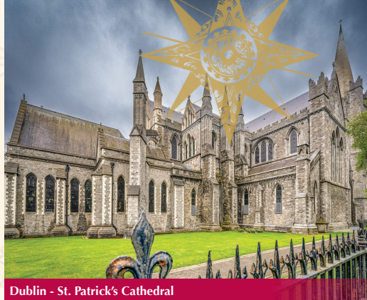
Dublin - St. Patrick's Cathedral