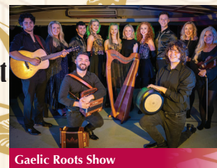
Gaelic Roots Show