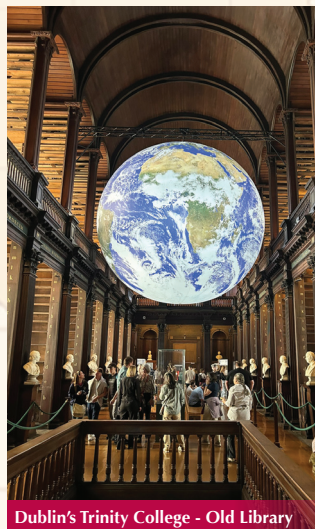
Dublin's Trinity College - Old Library