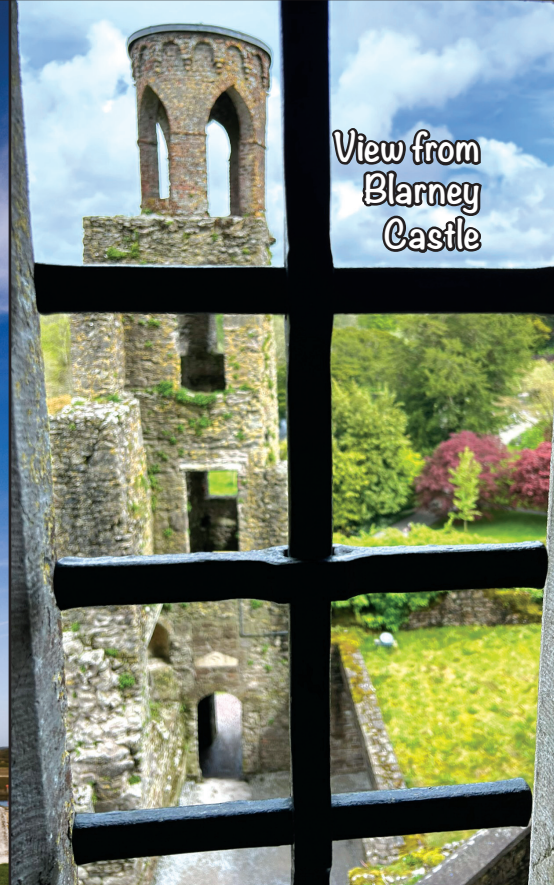
View from Blarney Castle