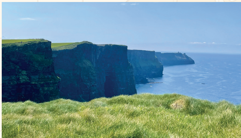
Cliffs of Moher - absolutely stunning!