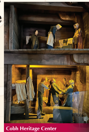
Cobh Heritage Center