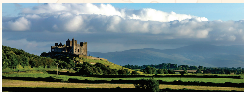
Rock of Cashel