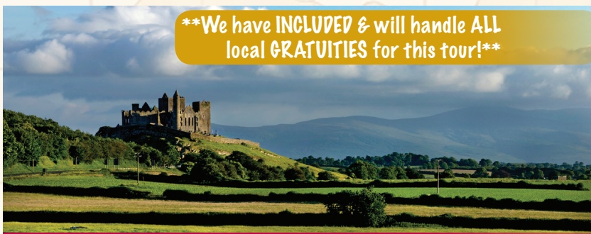
Rock of Cashel

**We have INCLUDED & will handle ALL local GRATUITIES for this tour!**