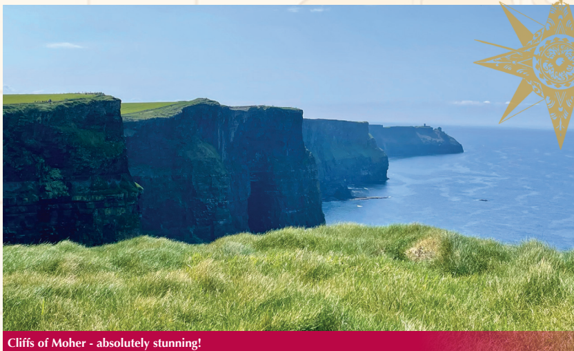
Cliffs of Moher - absolutely stunning!