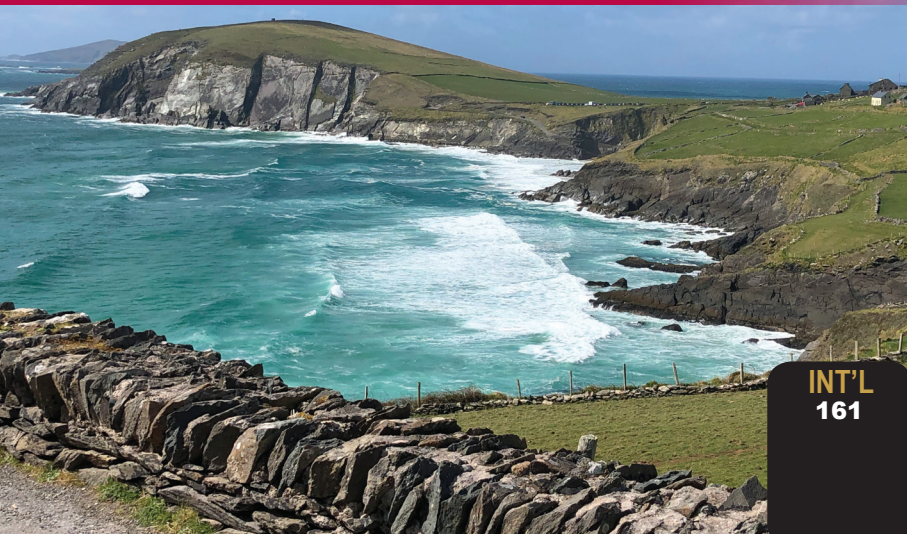
Incredible scenery awaits as we drive the Dingle Peninsula!