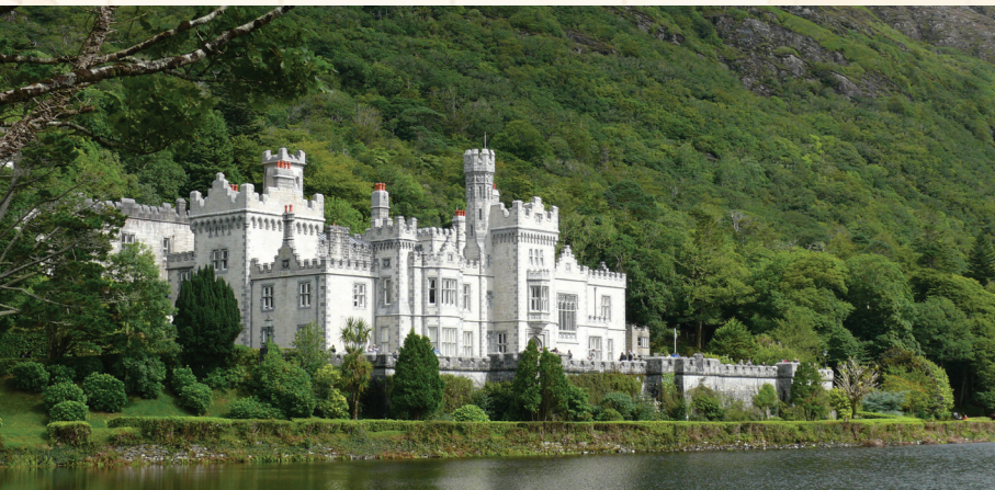
Kylemore Abbey - situated on the banks of the Pollacapall Lough