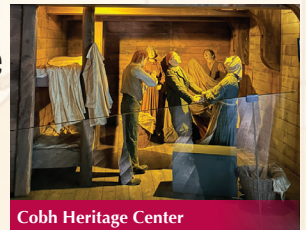
Cobh Heritage Center