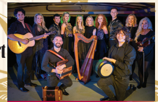
Gaelic Roots Show