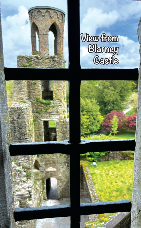
View from Blarney Castle