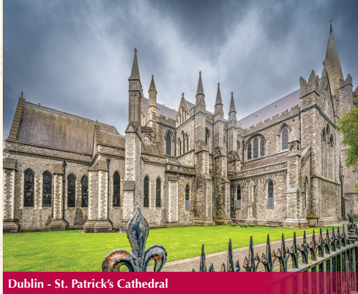
Dublin - St. Patrick's Cathedral