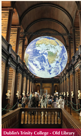
Dublin's Trinity College - Old Library