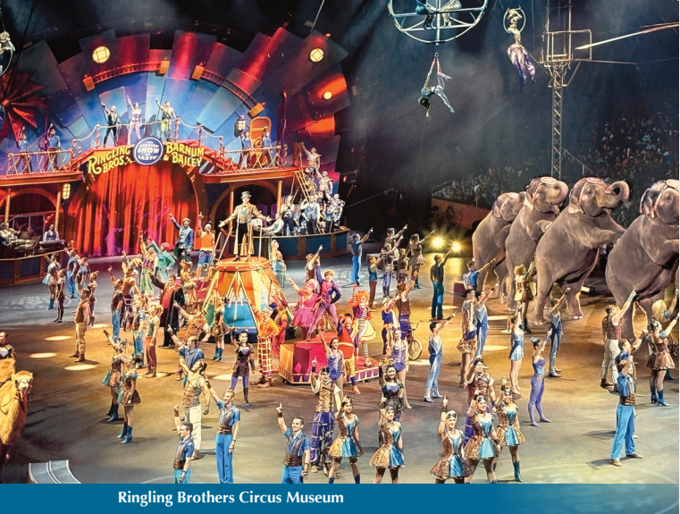
Ringling Brothers Circus Museum