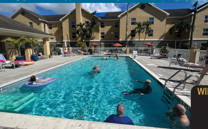
Soaking up the sun as we enjoy Homewood Suites' pool