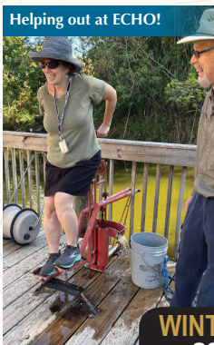
Helping out at ECHO!