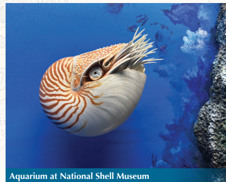
Aquarium at National Shell Museum