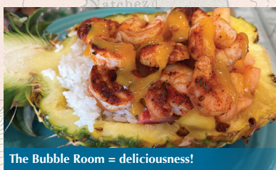
The Bubble Room = deliciousness!