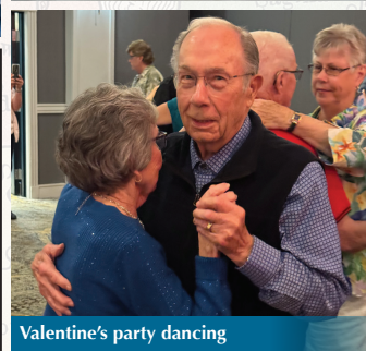
Valentine's party dancing