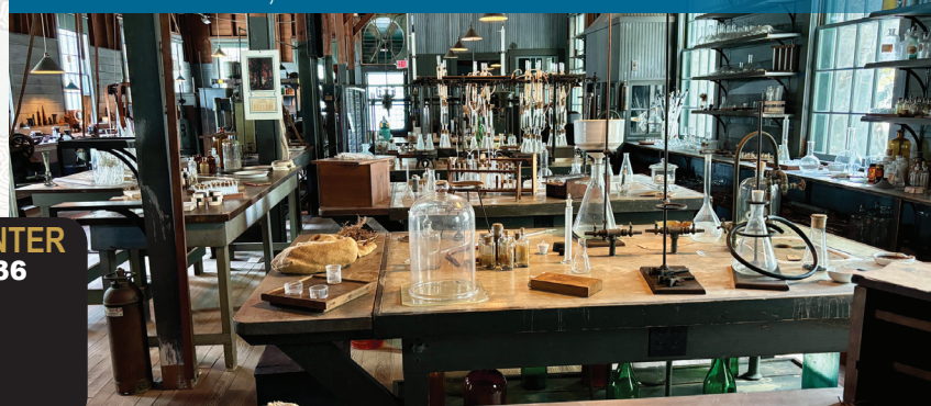
Incredible Research Laboratory at Edison & Ford Winter Estates