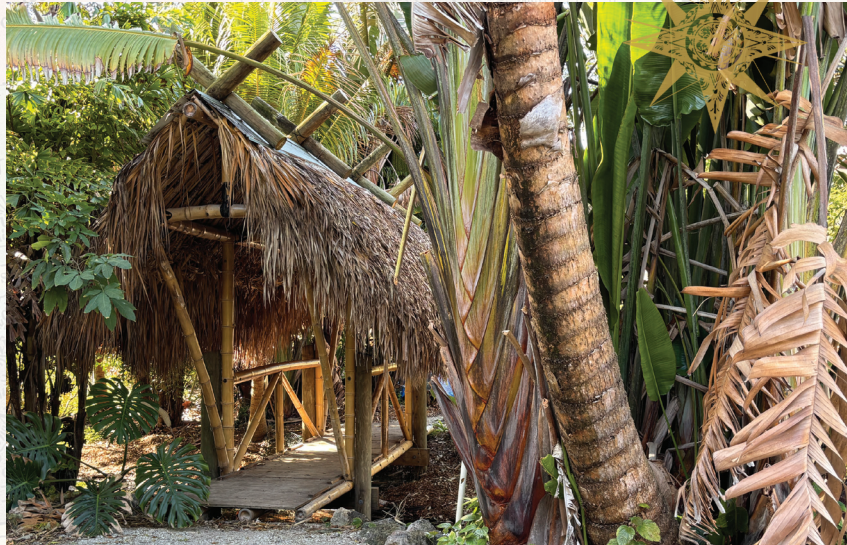
ECHO Global Farm - "Growing hope from the ground up"

Our comfy "home away from home" - which has been carefully selected for its convenient & safe location with many dining, shopping, and entertainment options within easy walking distance.