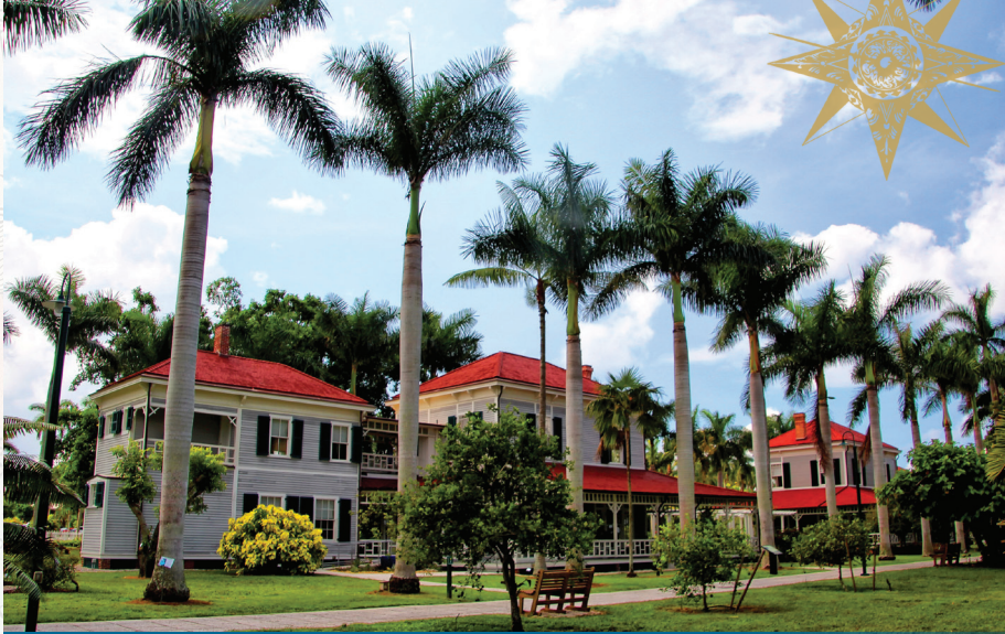
Ford & Edison Winter Estates