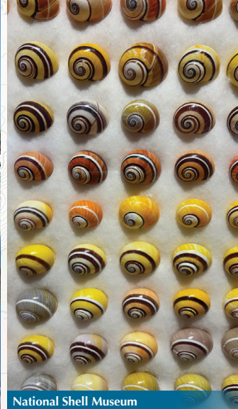
National Shell Museum