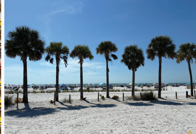
Enjoy Fort Myers Beach!