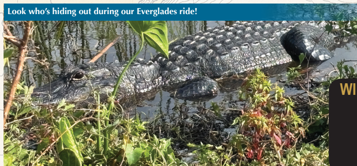
Look who's hiding out during our Everglades ride!