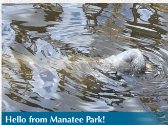
Hello from Manatee Park!