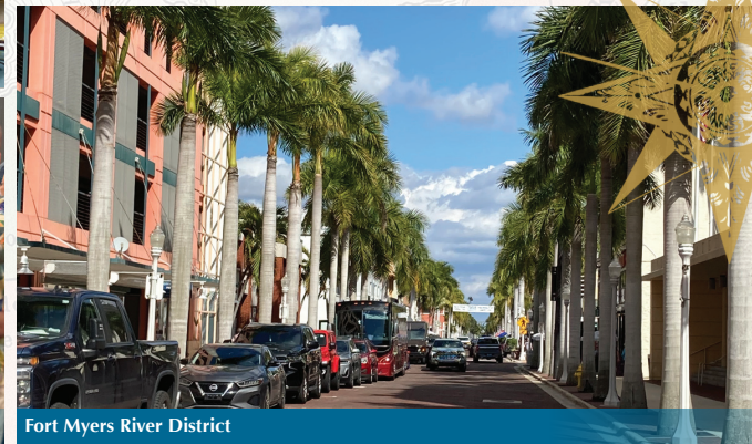
Fort Myers River District

homa!" This groundbreaking Rodgers & Hammerstein classic follows spirited farm girl Laurey and confident cowboy Curly as love blossoms against the backdrop of a growing territory on the brink of statehood. Featuring beloved songs like Oh, What a Beautiful Mornin' and People Will Say We're in Love , this vibrant musical celebrates community, hope, and the pioneering spirit that built the American West.