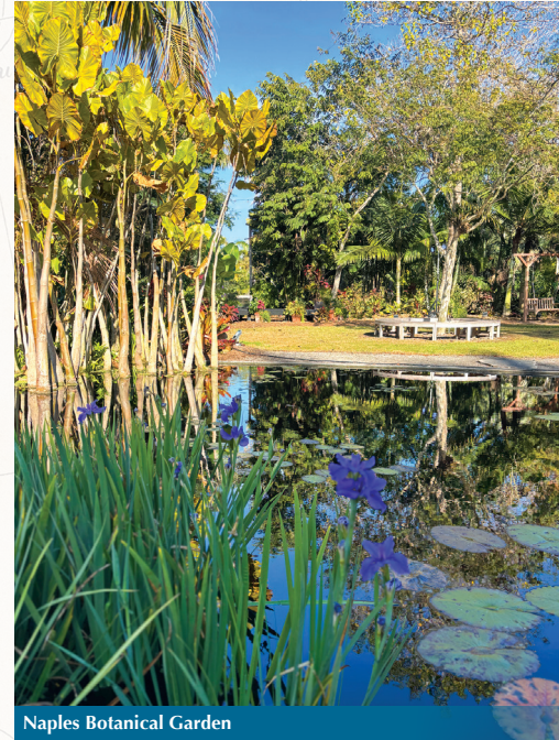
Naples Botanical Garden