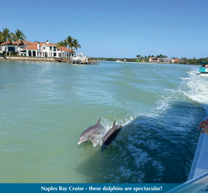
Naples Bay Cruise - these dolphins are spectacular!