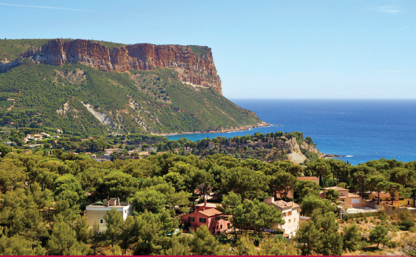
Calanques - depart on a sunset catamaran cruise from this seaside town!