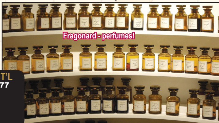
Fragonard - perfumes!

Hotel: The Deck Hotel or similar (3 Nights)