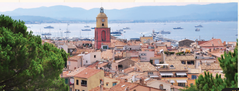
Enjoy a stop in the elegant seaside town of St. Tropez