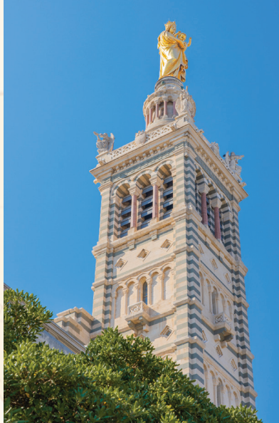
Notre-Dame de la Garde