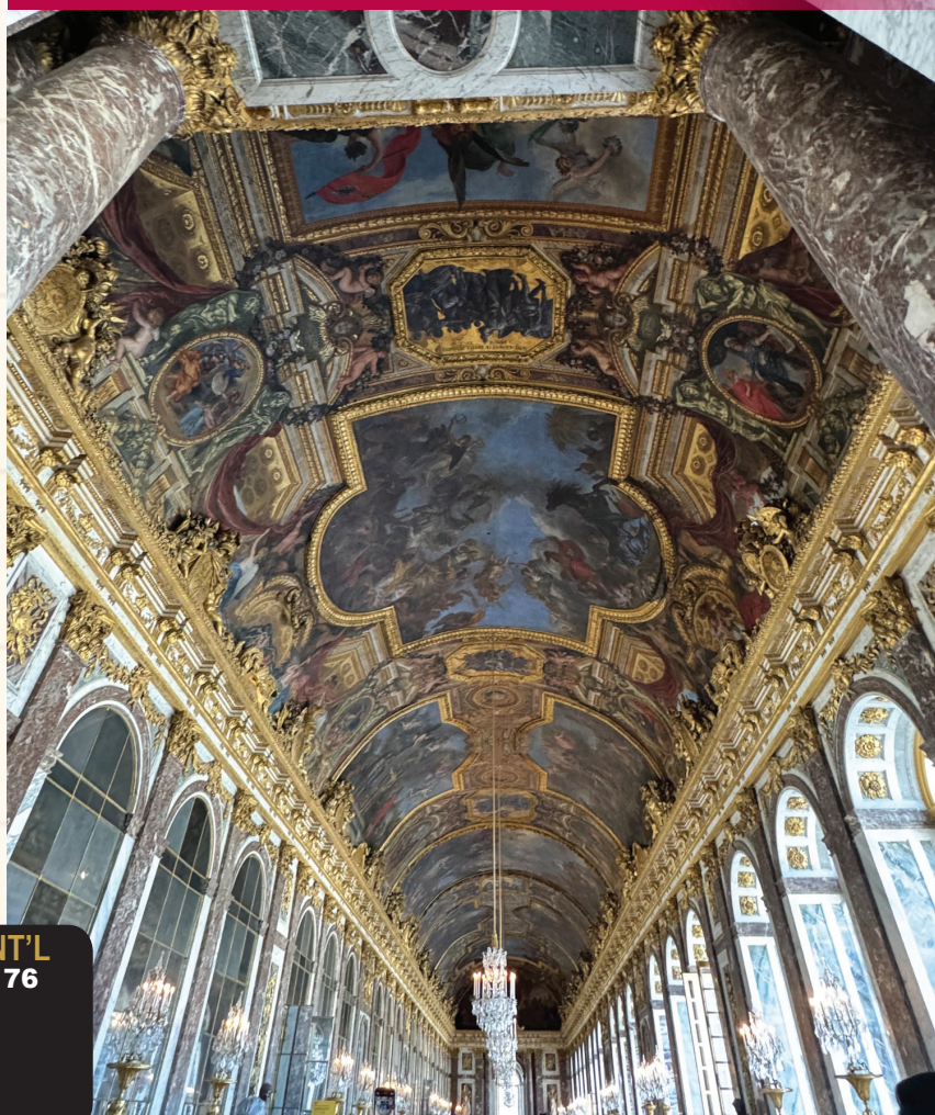
Palace of Versailles - remarkable Hall of Mirrors room