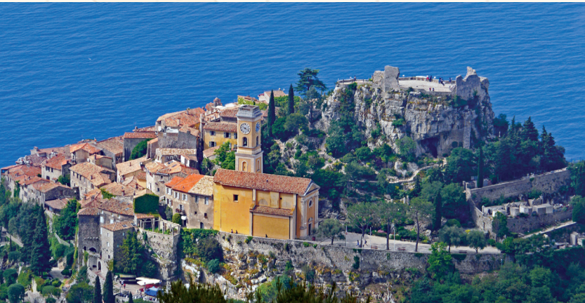
Hilltop village of Èze

France's Finest: Paris, Provence & the French Riviera