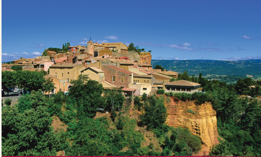
Roussillon - an astonishing ochre village, famous for its rich deposits of ochre pigments