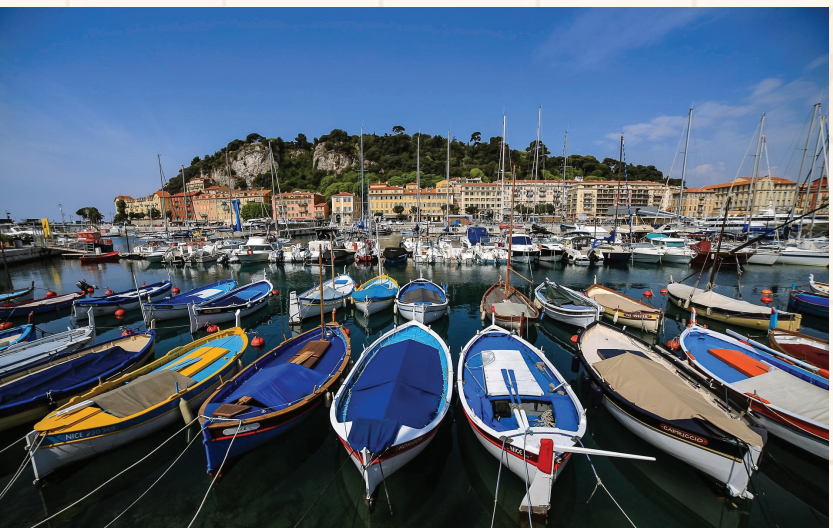
Spend 3 nights in Nice on the French Riviera!