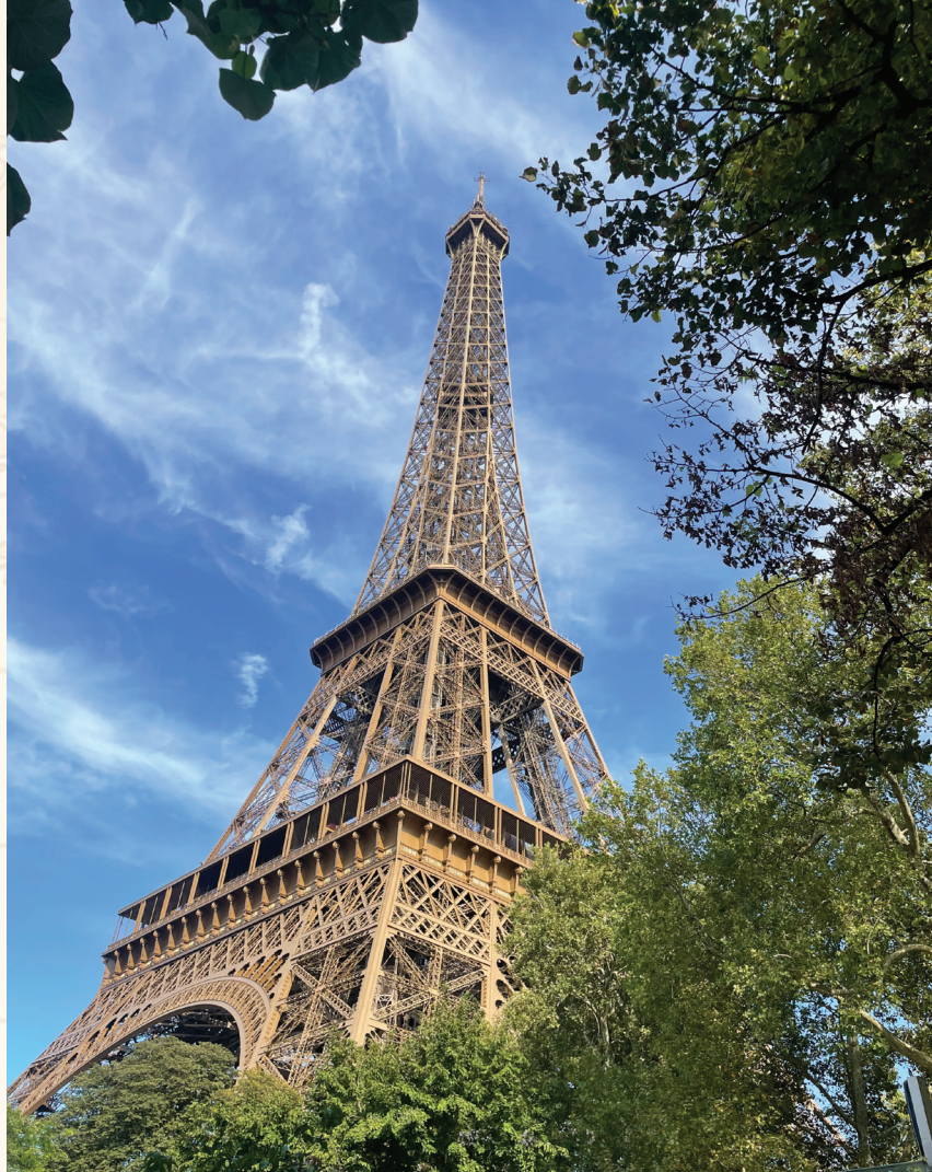
Experience dinner in the Eiffel Tower as well as great views of the tower during our cruise!

Hotel: Mercure Marseille Canebiere Vieux-Port (4 Nights)