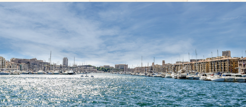
Marseille - stay 4 nights in France's oldest city!