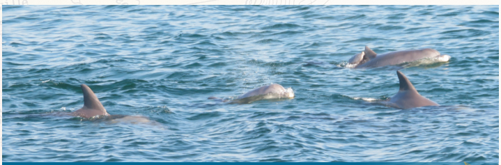
Spotting dolphins at play!