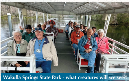
Wakulla Springs State Park - what creatures will we see?!