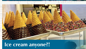
Ice cream anyone?!