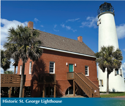
Historic St. George Lighthouse