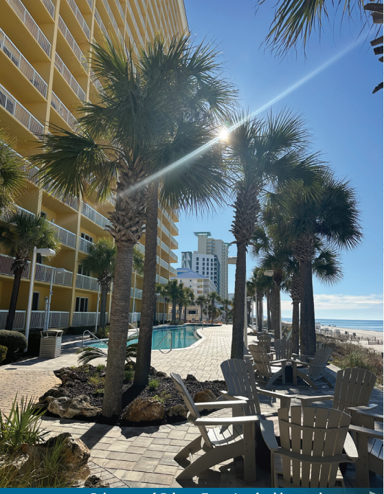
Enjoy one of Calypso Tower's refreshing pools