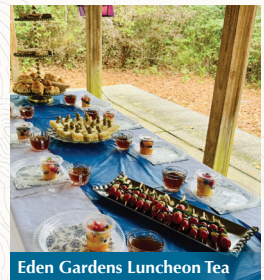
Eden Gardens Luncheon Tea