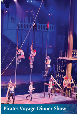
Pirates Voyage Dinner Show