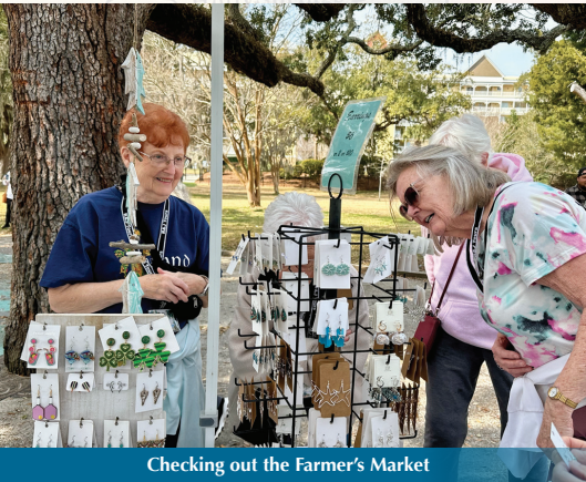
Checking out the Farmer's Market