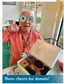
Three cheers for donuts!