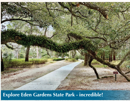
Explore Eden Gardens State Park - incredible!