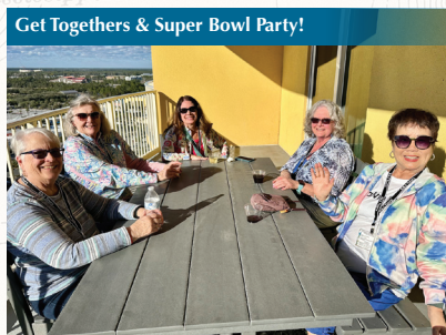
Get Togethers & Super Bowl Party!