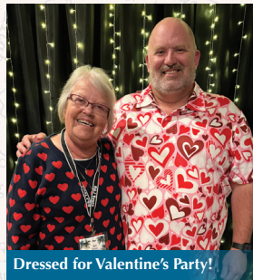
Dressed for Valentine's Party!