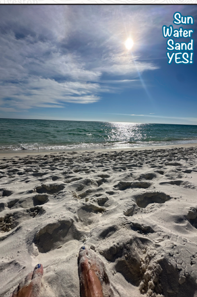
Sun Water Sand YES!