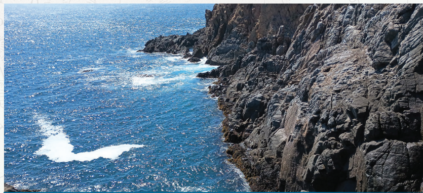
Ensenada's rocky coastline provides a breathtaking backdrop!