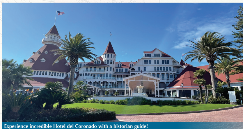
Experience incredible Hotel del Coronado with a historian guide!