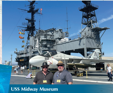
USS Midway Museum