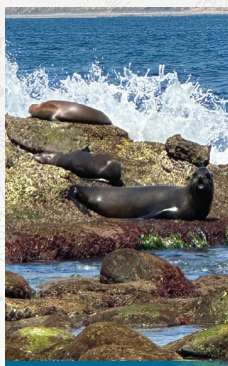
La Jolla's sea lions