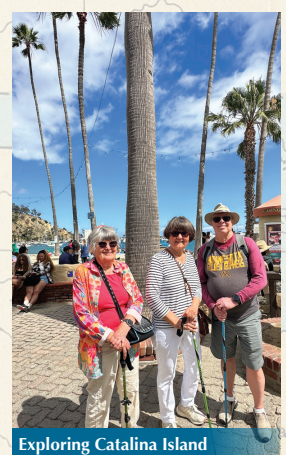
Exploring Catalina Island