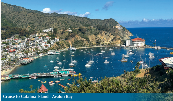
Cruise to Catalina Island - Avalon Bay