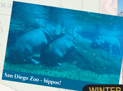
San Diego Zoo - hippos!