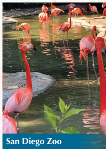
San Diego Zoo