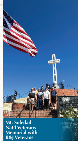
Mt. Soledad Nat'l Veterans Memorial with R&J Veterans