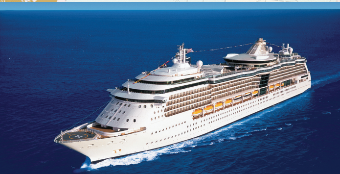
4 Nights cruising on the Serenade of the Seas