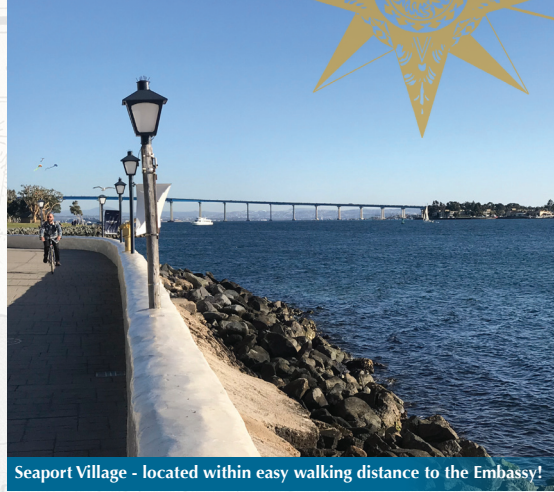
Seaport Village - located within easy walking distance to the Embassy!