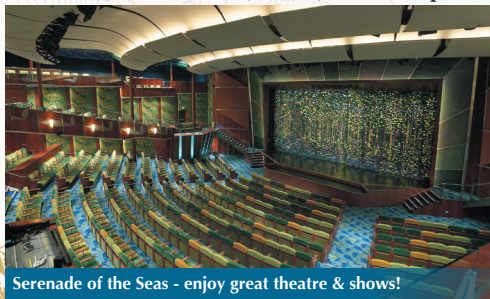
Serenade of the Seas - enjoy great theatre & shows!

Included Meals: Breakfast, Lunch, Guest Reception