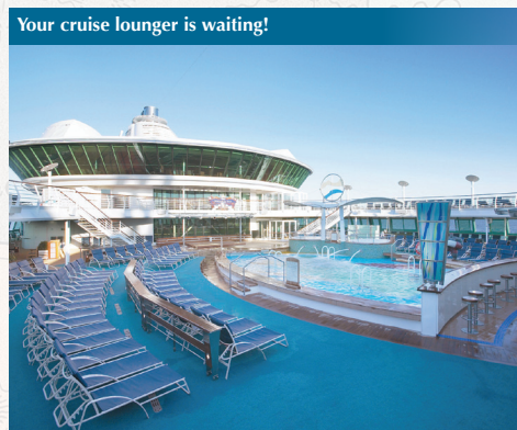
Your cruise lounge is waiting!