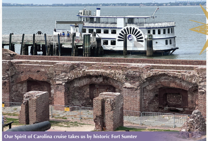
Our Spirit of Carolina cruise takes us by historic Fort Sumter