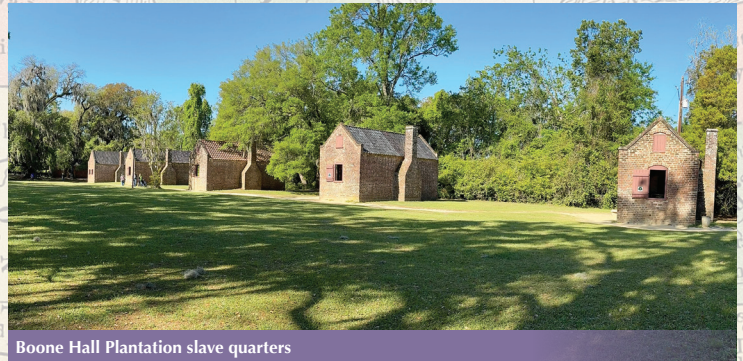
Boone Hall Plantation slave quarters