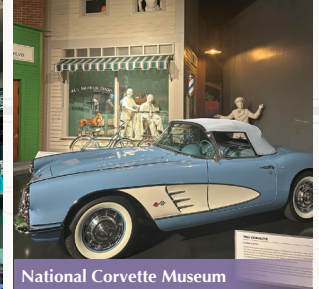
National Corvette Museum