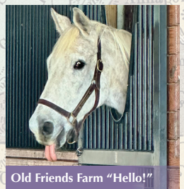
Old Friends Farm "Hello!"