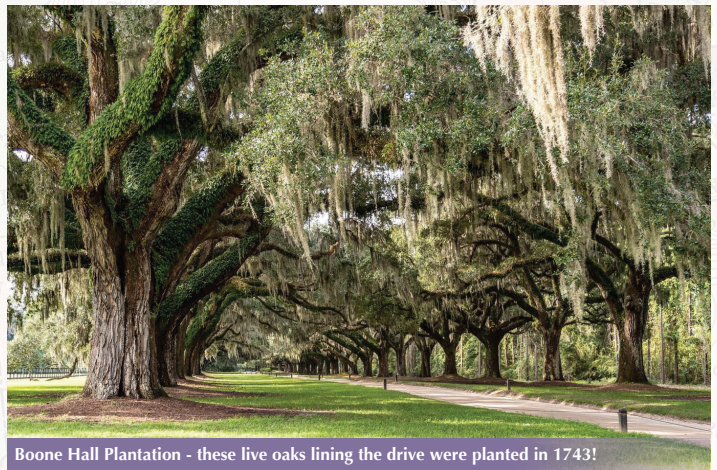
Boone Hall Plantation - these live oaks lining the drive were planted in 1743!