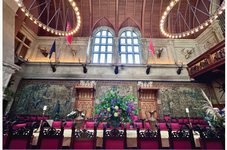
Tour the remarkable Biltmore Estate!