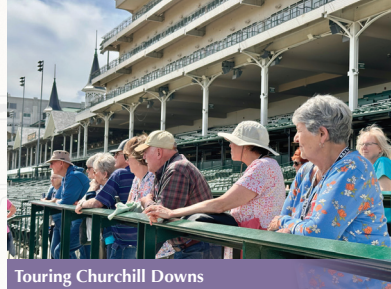
Touring Churchill Downs

A step-on guide joins us this morning, helping to bring Savannah's charm and history to life. Our first visit is the