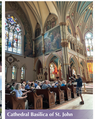
Cathedral Basilica of St. John