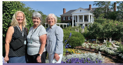
Lovely gardens at Boone Hall Plantation