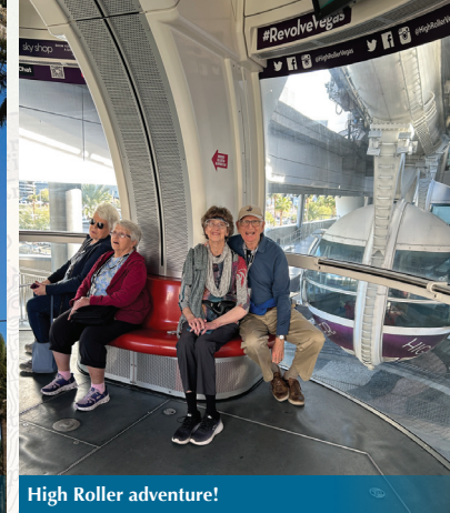
High Roller adventure!

is a guided city tour of Las Vegas, including downtown, the strip, and so much more. Lunch will be on your own before it's time to see Las Vegas from a different view. The High Roller Wheel ride is one that you will not want to miss! We will soar 550 feet above the center of the Las Vegas Strip on the largest observation wheel in North America. With sweeping 360-degree views, the wheel takes 30 minutes to complete one revolution and features 28 spacious cabins for our comfort. Afterwards, we'll visit the Neon Museum, a captivating outdoor gallery where historic neon signs tell the colorful story of Las Vegas through the decades. Then we make our way to a unique dinner theatre. The Firelight Barn is servin' up mouth-watering, Chuckwagon style BBQ and award-winning entertainment with Mama's Wranglers, the Jackson Family Band & Cloggers!