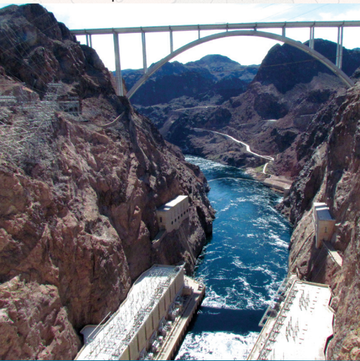
View from Hoover Dam of Colorado River