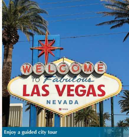
Enjoy a guided city tour

Breakfast is included at the resort this morning. Then we will begin our day with a step-on guide who is excited to show us so much about Nevada that we did not know before. Get ready for a sweet stop at Pinkbox Doughnuts, where vibrant, over-the-top creations turn a simple treat into a memorable experience - yum! Another sweet stop is in order at Ethel M Chocolates for a Tasting Experience which includes a bit of education on how chocolate is sourced, refined and produced, as well as the subtleties of chocolate tasting and flavor identification. Afterward, we'll be an honorary chocolatier with a certificate to prove it! There will be time for shopping so you can stock up and keep your sweet tooth satisfied. Then we'll step outside to Ethel's Botanical Cactus Garden, which is Nevada's largest cactus garden and one of the most prolific collections of its kind. Their 3-acre garden features more than 300 species of plants, including cacti and succulents native to the American Southwest as well as desert trees and shrubs from the Southwestern United States, Australia, and South America. Each of the plants were carefully selected for the beauty of their floral displays and their ability to adapt to and thrive in the climate of the Mojave Desert. Next up