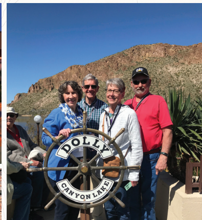
It's cruising time!