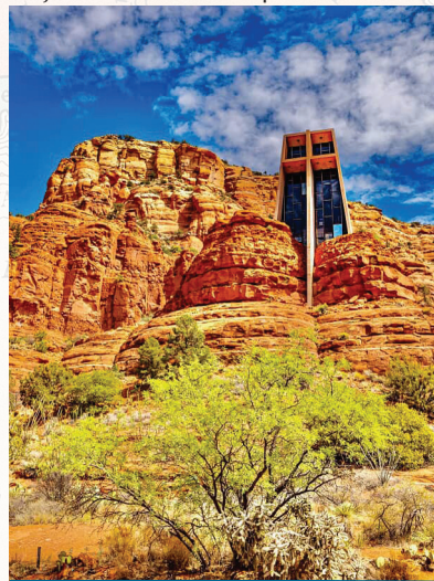
Picturesque Chapel of the Holy Cross

We'll thoroughly enjoy a tour & tasting experience at Ethel M Chocolates - YUM!