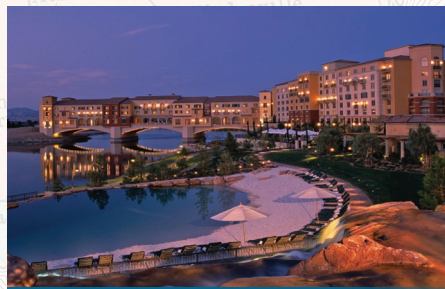
A wonderful 2 night stay at Hilton Lake Las Vegas!