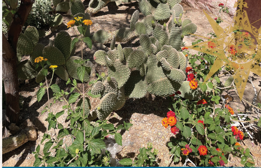
Nevada's arid beauty awaits at Ethel M's Botanical Cactus Garden