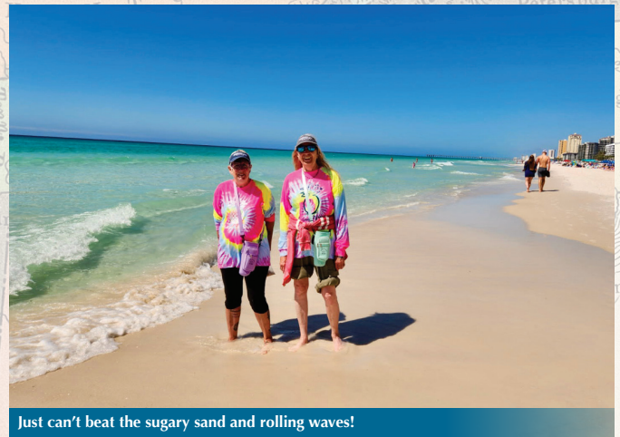
Just can't beat the sugary sand and rolling waves!