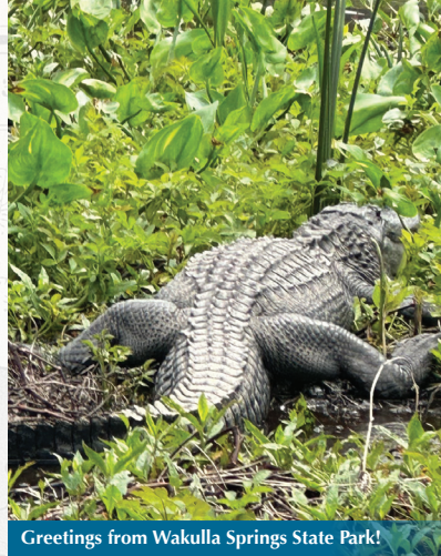
Greetings from Wakulla Springs State Park!