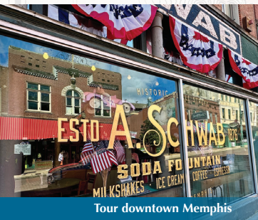
Tour downtown Memphis