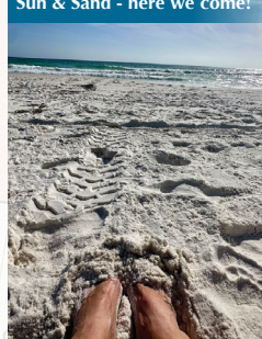
Sun & Sand - here we come!

Our singing guide will take us on a great discovery of Memphis!