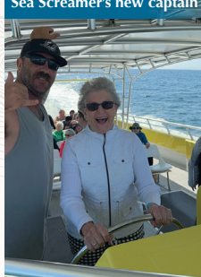
Sea Screamer's new captain