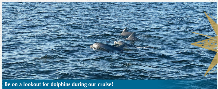
Be on a lookout for dolphins during our cruise!