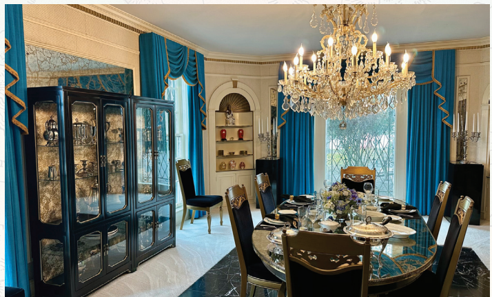
Tour Elvis' Graceland - the Presley's always placed their Christmas tree in the dining room