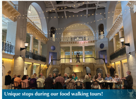
Unique stops during our food walking tours!