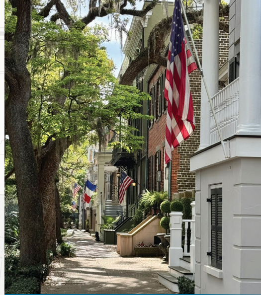
Explore charming Savannah