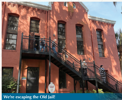
We're escaping the Old Jail!