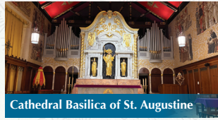
Cathedral Basilica of St. Augustine