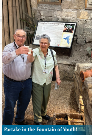
Partake in the Fountain of Youth!