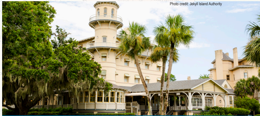
Trolley tour of Jekyll Island - 1888 Jekyll Island Clubhouse takes us back to the Gilded Ages