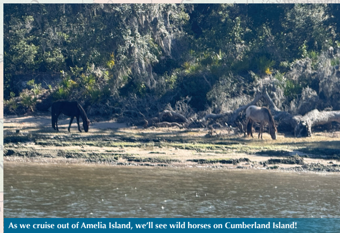
As we cruise out of Amelia Island, we'll see wild horses on Cumberland Island!