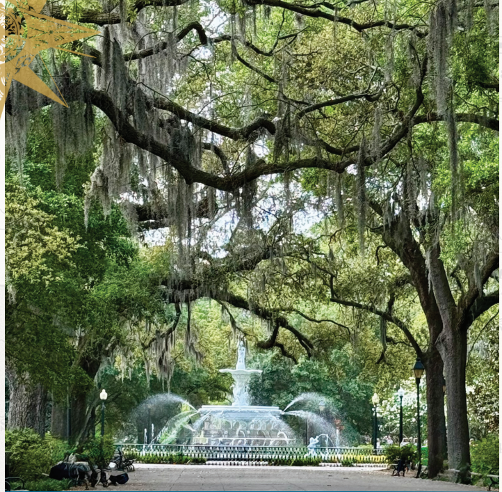
Iconic Forsyth Park in Savannah - standing at 30 feet tall, this fountain was built in 1858!

After breakfast is The Old Jail, where we'll get to see the prison cells and hear stories of the injustices that occurred under its notorious sheriff who oversaw the prison. Beware! Following is the Florida Heritage Museum where we'll be taken on a sweeping historical journey of the people, places, and things that helped shape this age-old city into a wonderful place to live. The